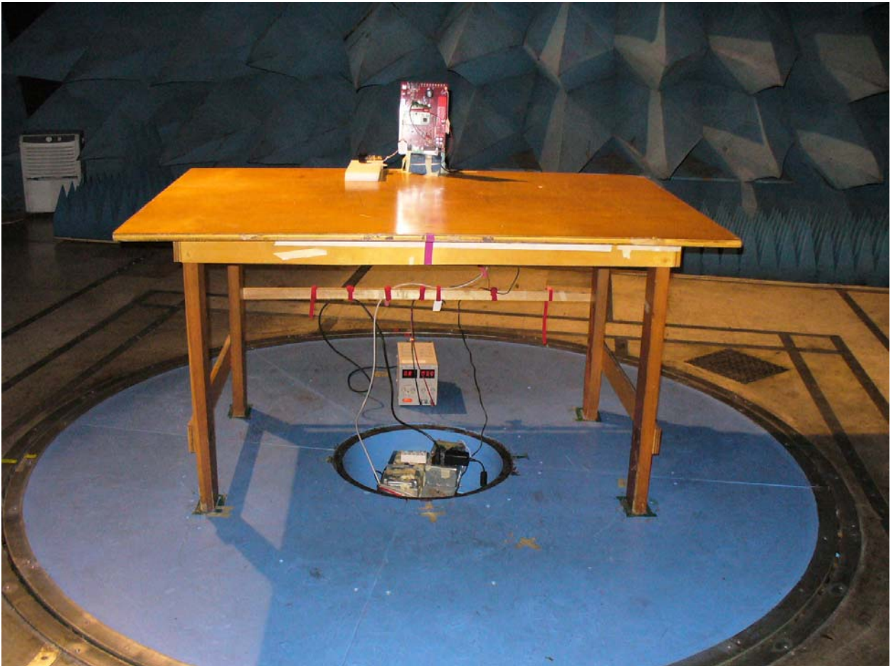
Figure 1: Radiated Emissions – Front View