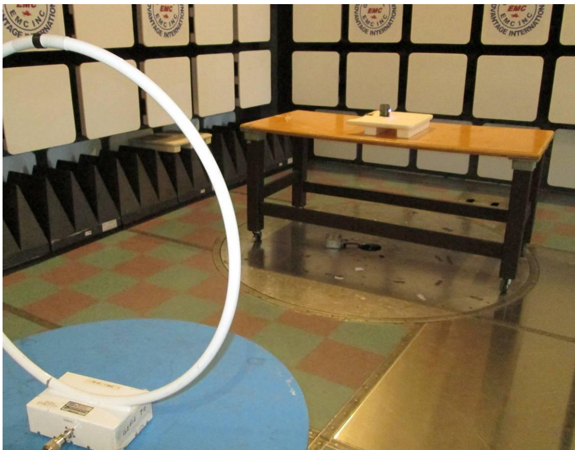
Radiated Emissions Photo 1