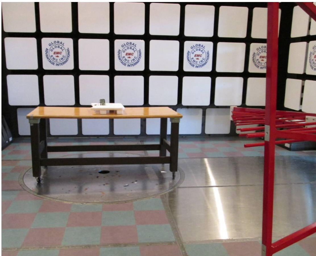
Radiated Emissions Photo 2