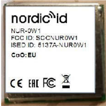
Picture 1. NUR-0W1 with type label