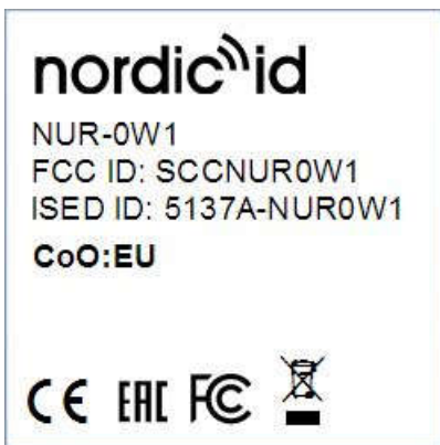
Picture 3. NUR-0W1 Label design