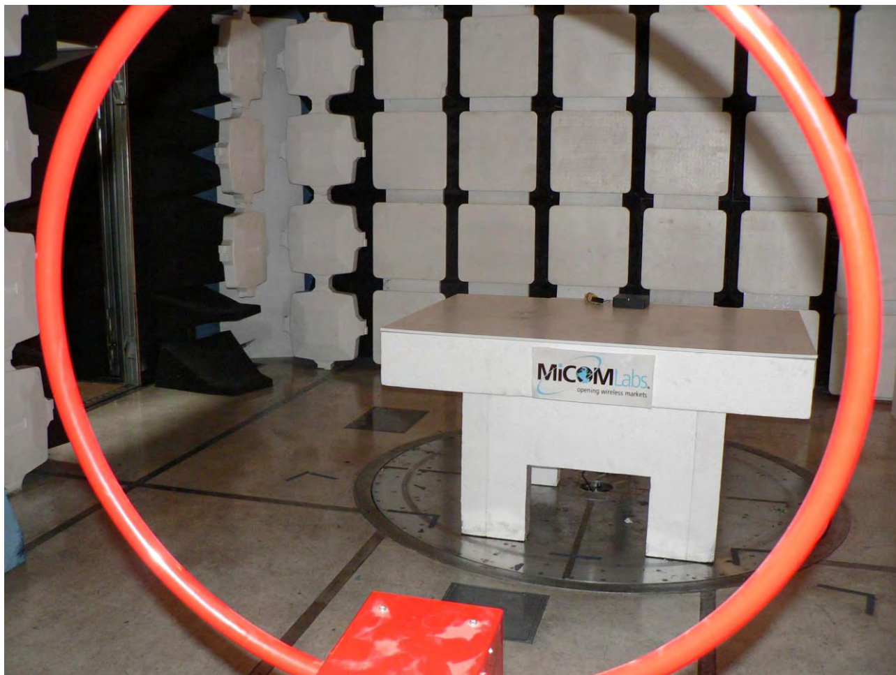
TX Spurious 9 KHz – 30 MHz