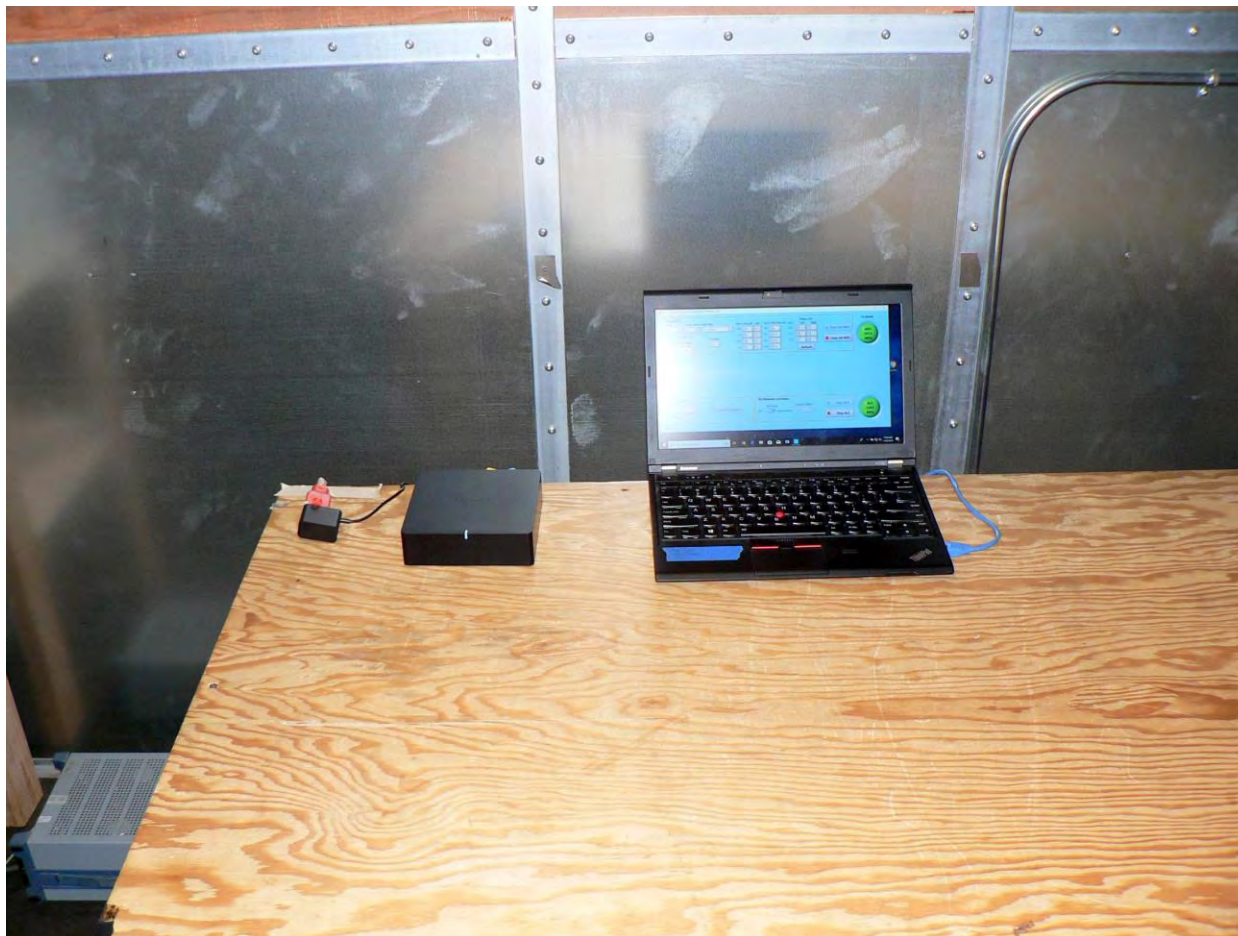
AC Mains Conducted Front