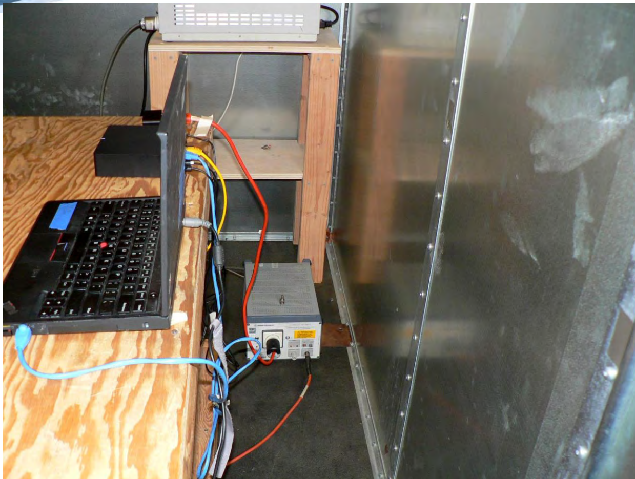
AC Mains Conducted Side