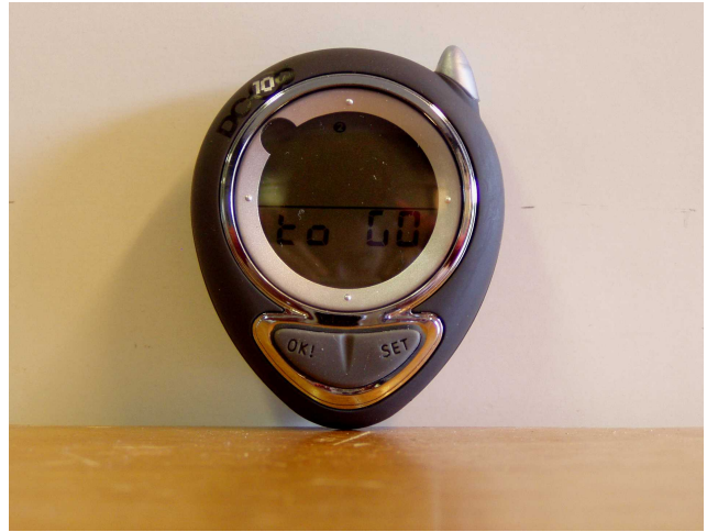
General view (DC7r and DC10r, computer)