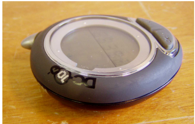
Detail view, DC7r and DC10r (Computer)