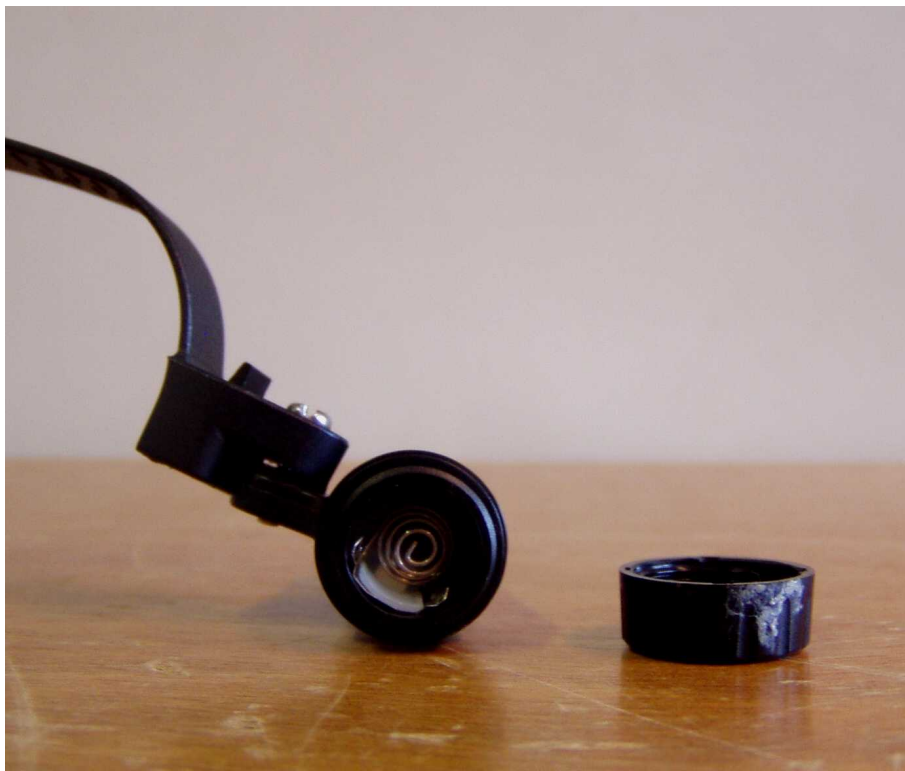
Detail view, transmitter (battery cover removed)