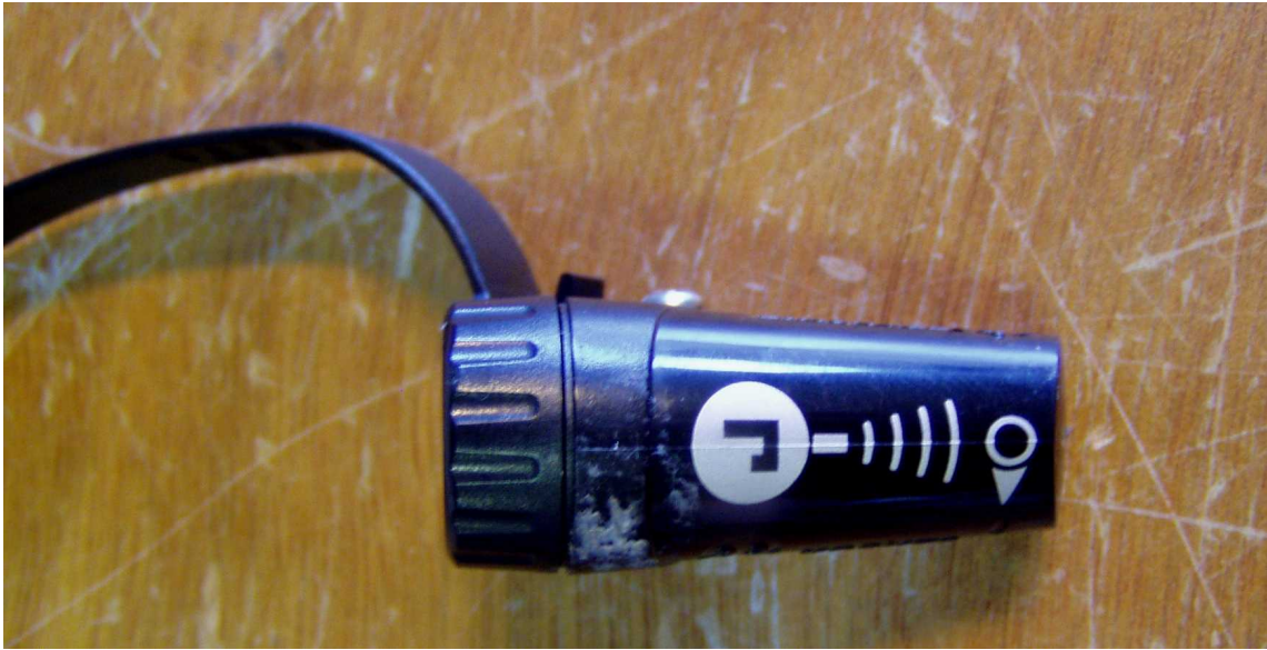
General view, transmitter