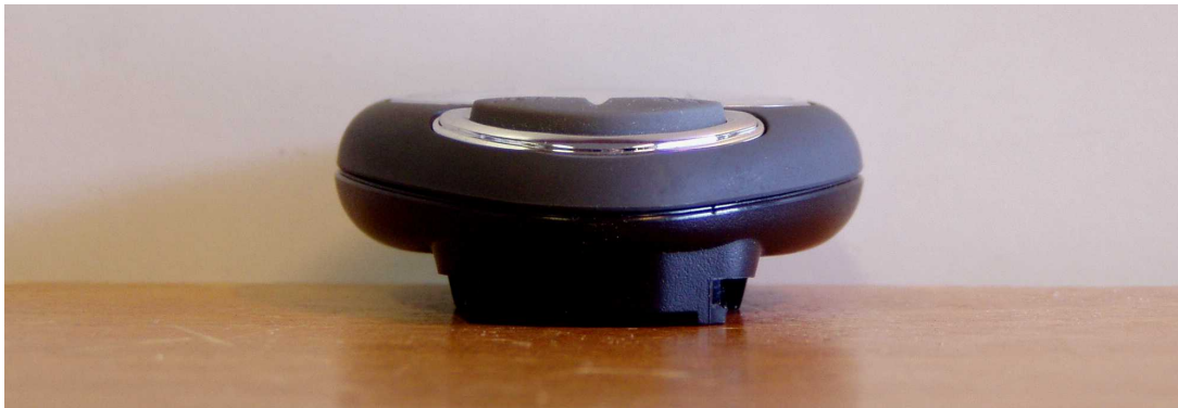
Side views, DC7r and DC10r (Computer)