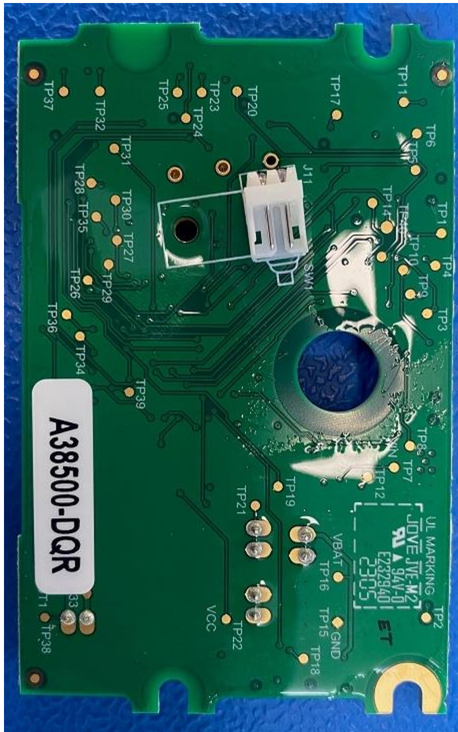
Figure 2: Main PCB Bottom