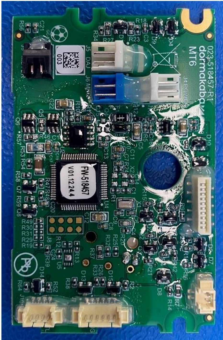
Figure 1: Main PCB Top