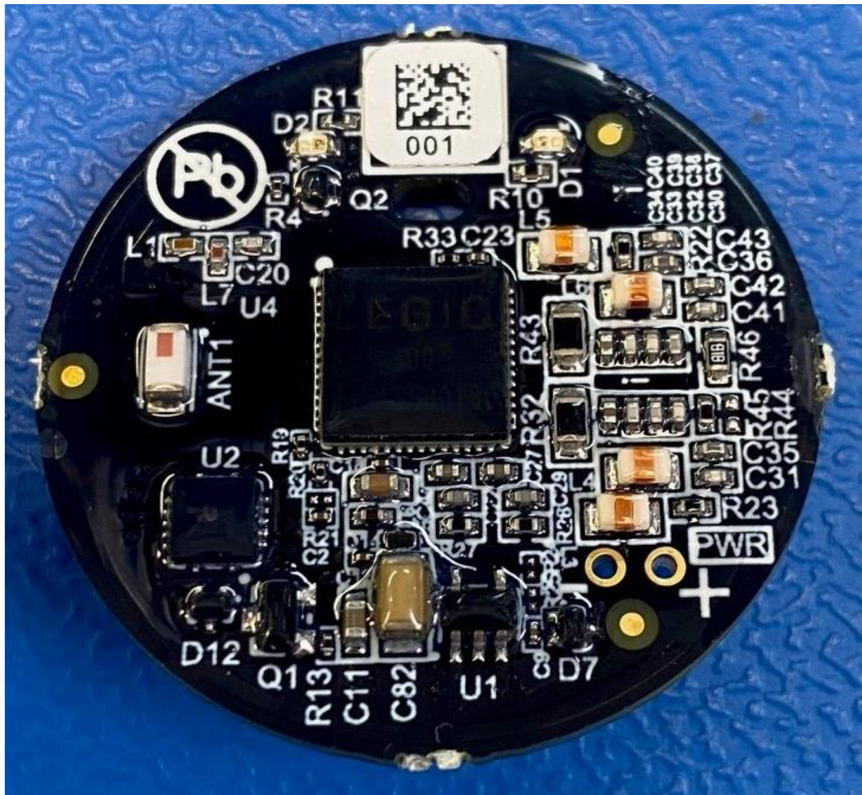
Figure 4: Reader PCB Bottom