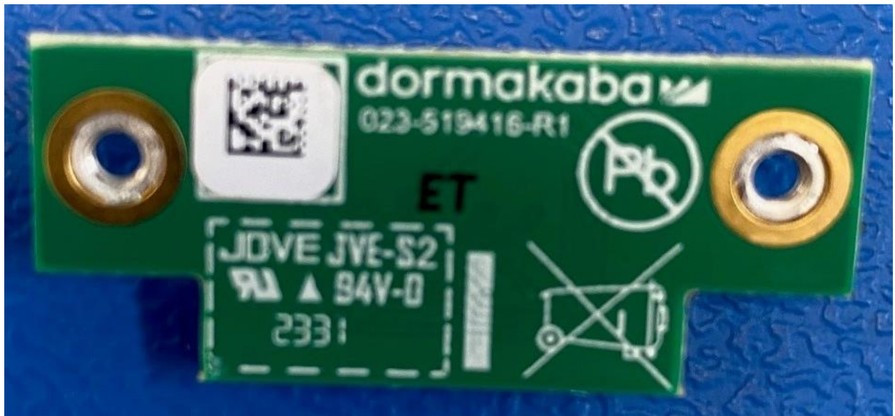
Figure 6: Interconnect PCB Bottom