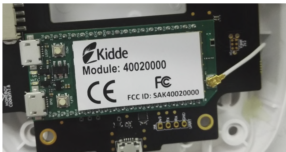
Figure 1: Sample Label and Location