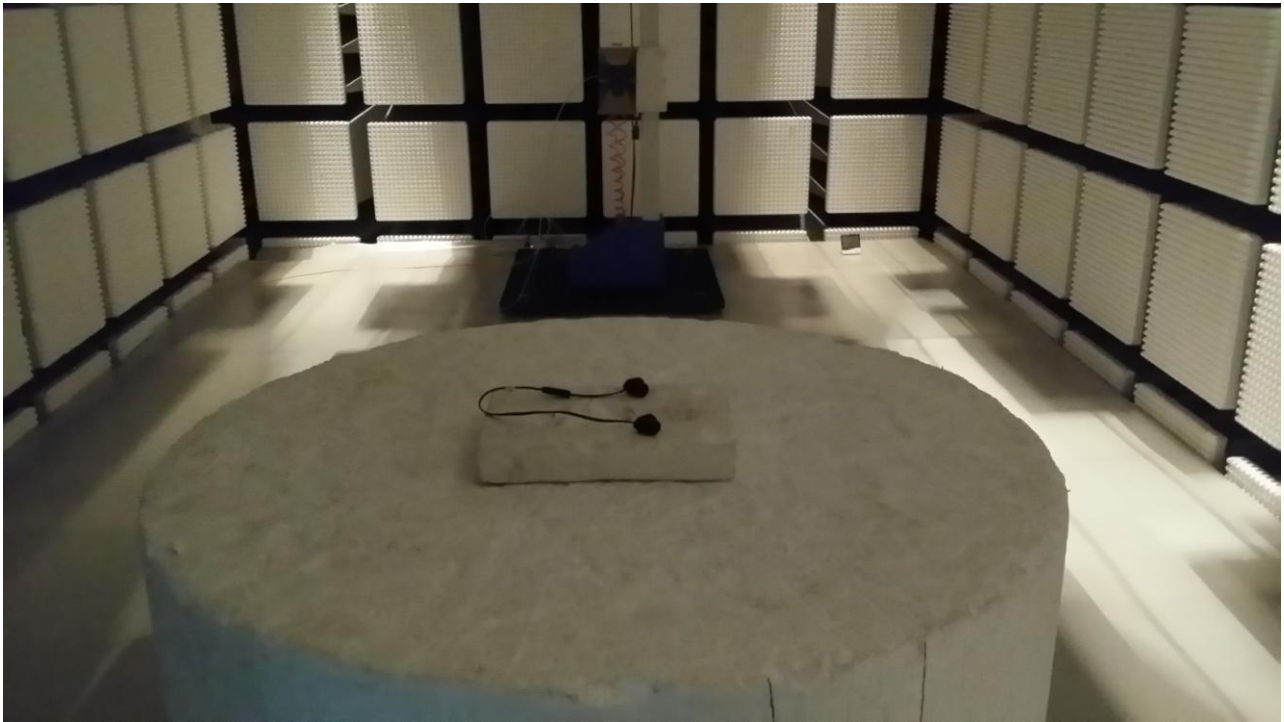
Transmitting spurious emission (Above 1GHz)