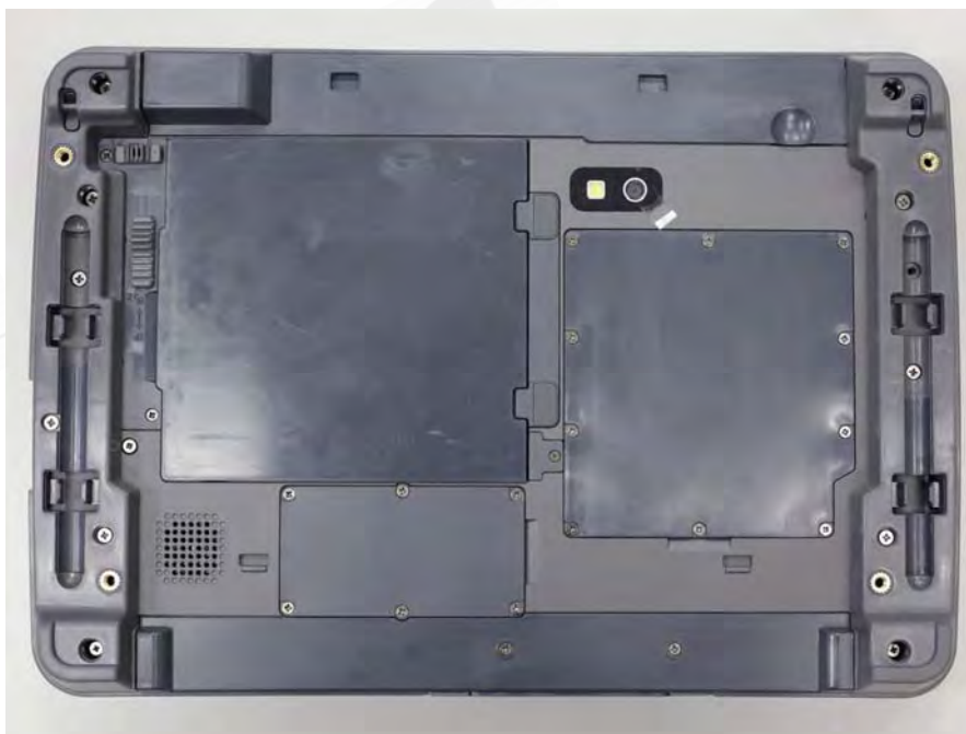
Fig.14 Back view of EUT with bumper (With left/right/GPS bumper attached)