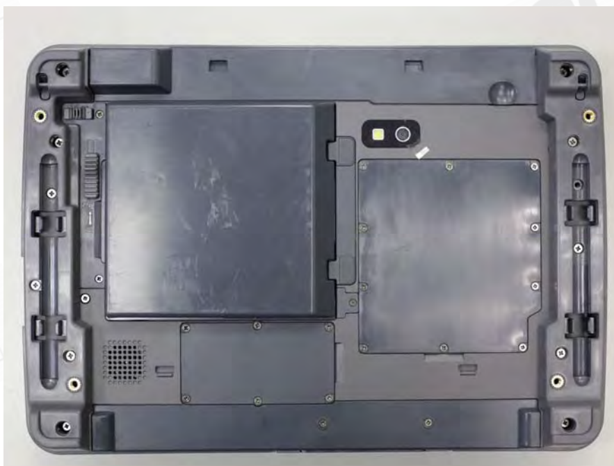
Fig.15 Back view of EUT with bumper and optional battery

Unless otherwise stated the results shown in this test report refer only to the sample(s) tested and such sample(s) are retained for 90 days only.