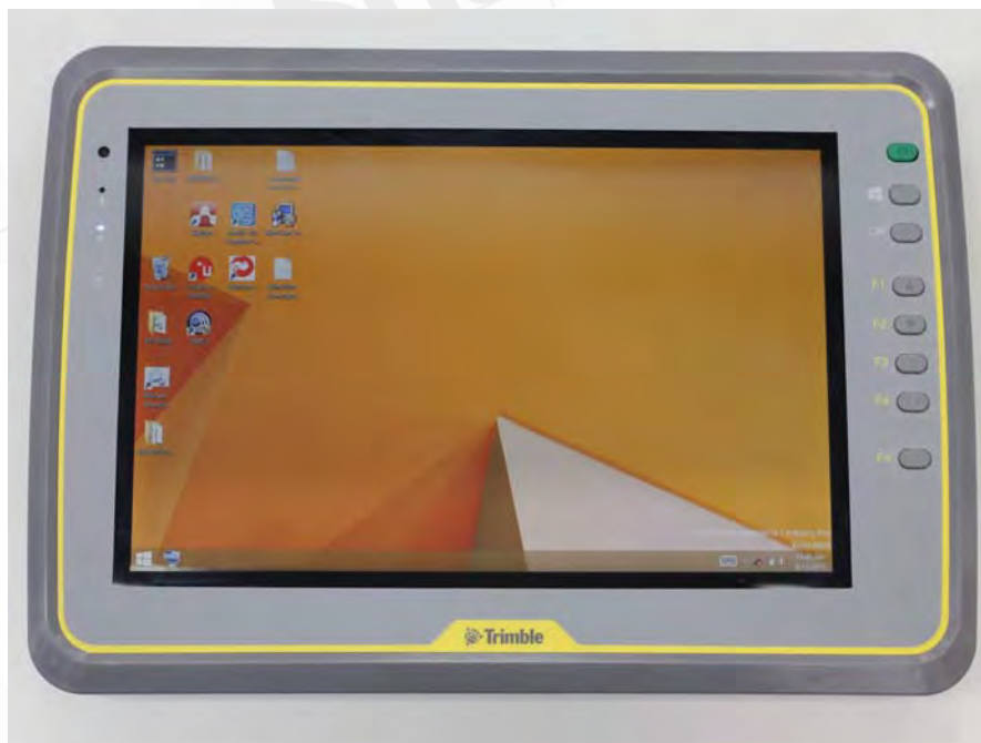
Fig.12 Front view of EUT