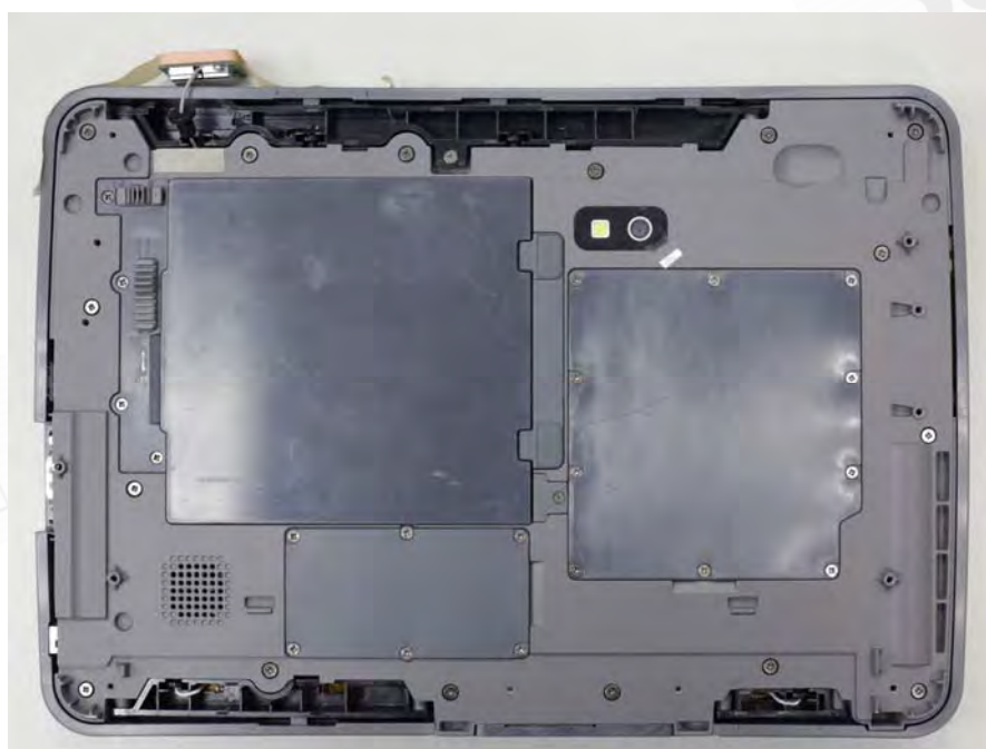
Fig.13 Back view of EUT (Remove left/right bumper and unload GPS cover)

Unless otherwise stated the results shown in this test report refer only to the sample(s) tested and such sample(s) are retained for 90 days only.