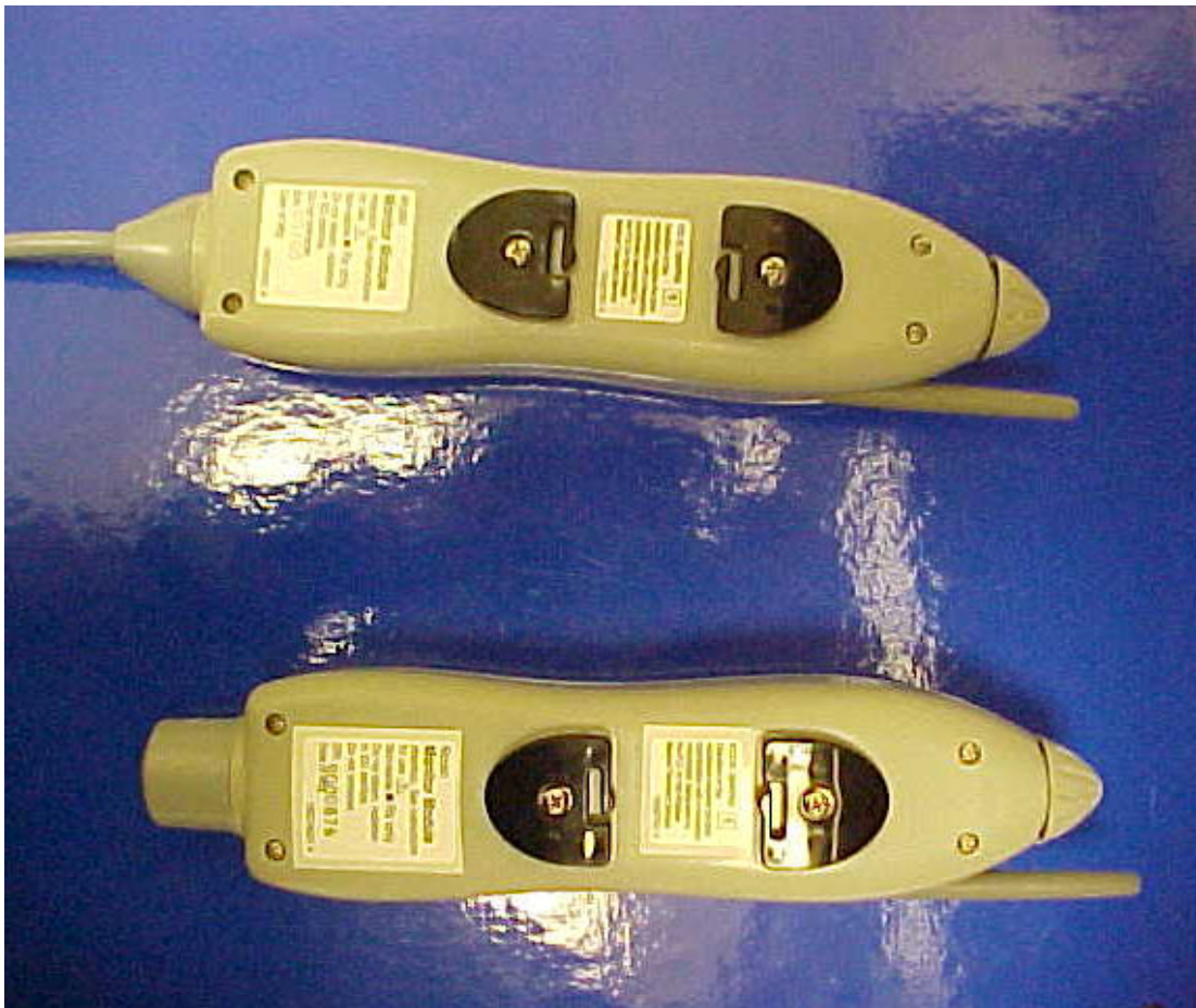
X and M units, Rear View, Label Location.