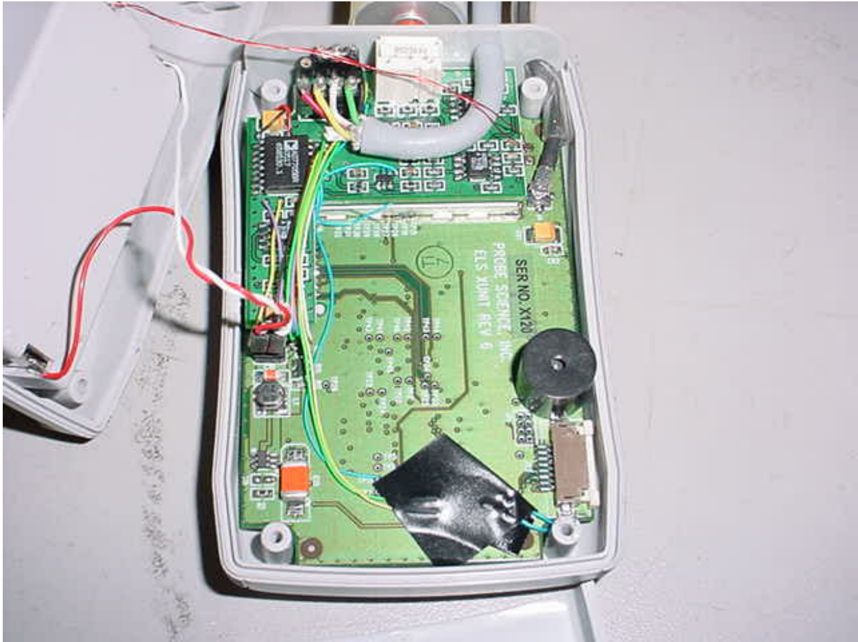
X Unit, Board Layout, External Cable Connections, Component View