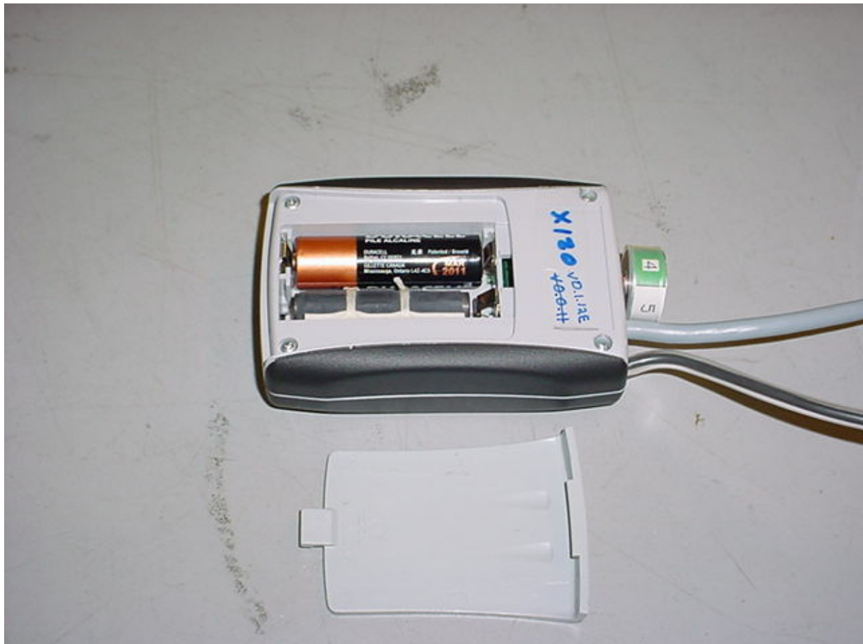
X Unit, Battery Compartment and RFIG Antenna. Rear Cover Removed.