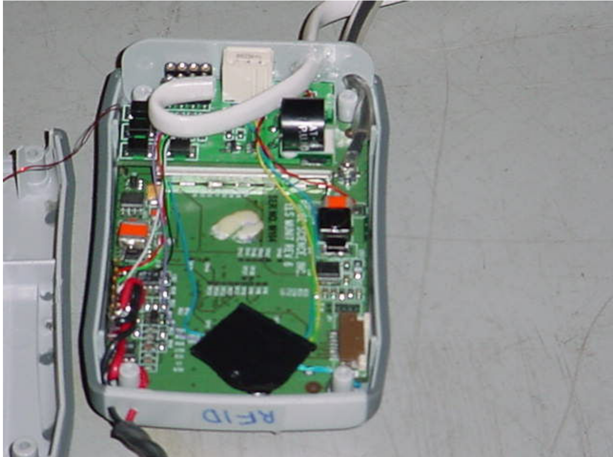
M Unit, Board Layout, External Cable Connections, Component View.