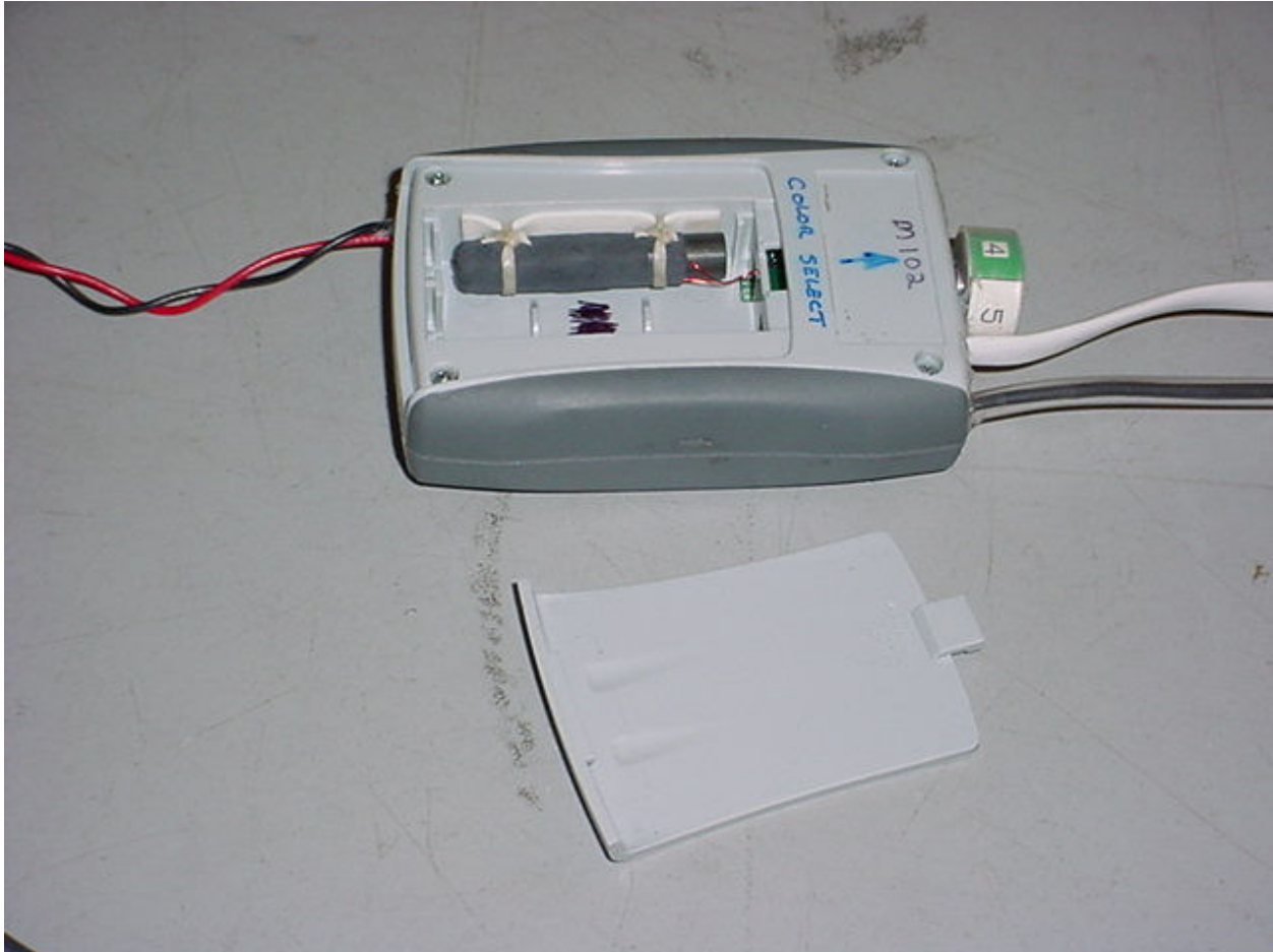
M Unit, Battery Compartment and RFID Antenna. Rear Cover Removed.