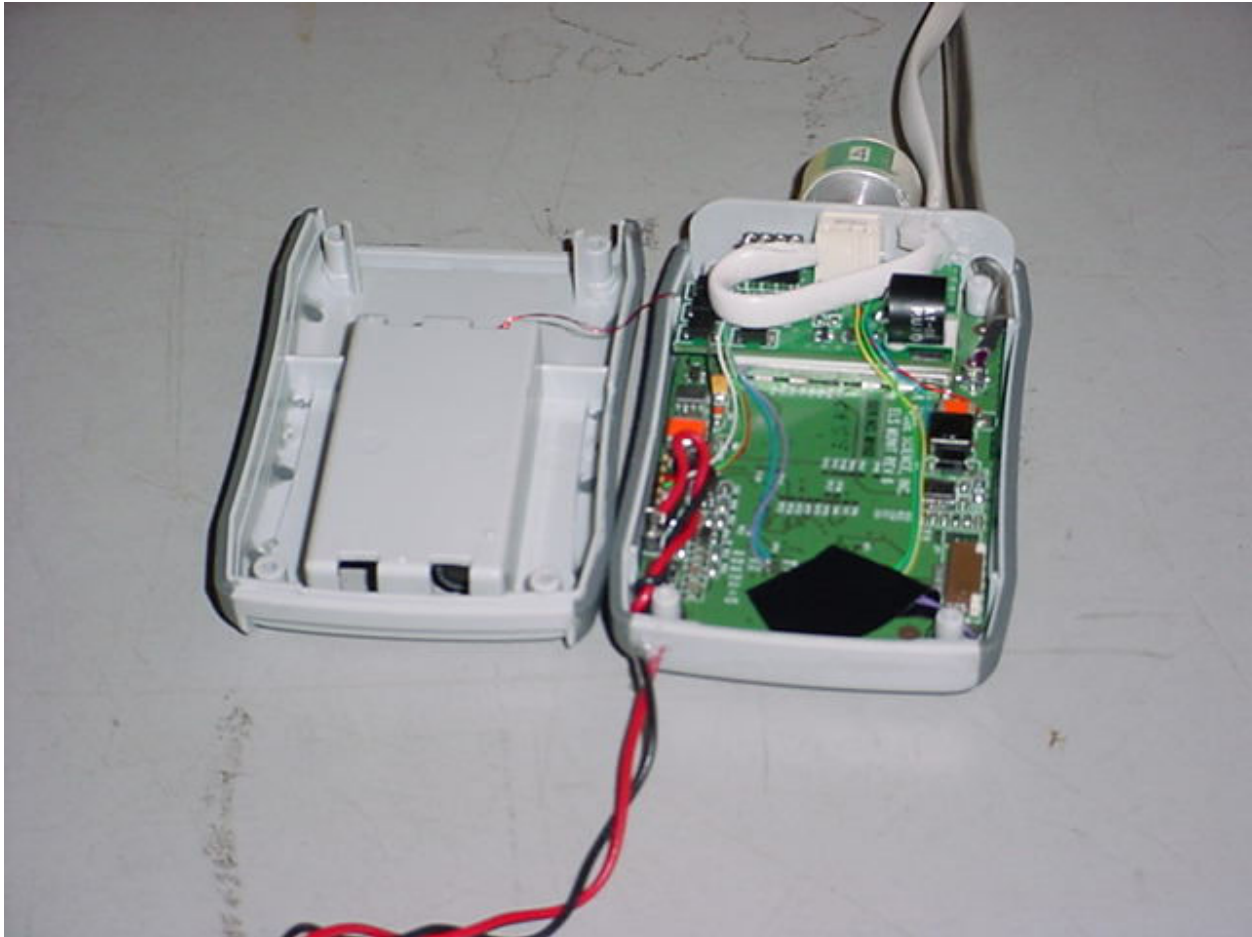
M Unit, Inside Boards Layout