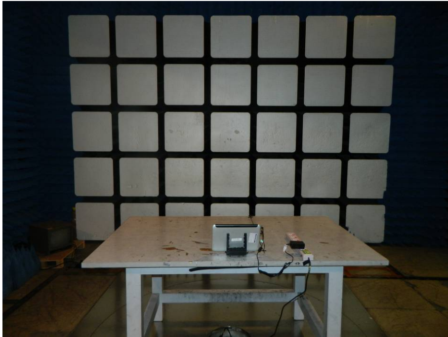
Conducted Measurement Photo