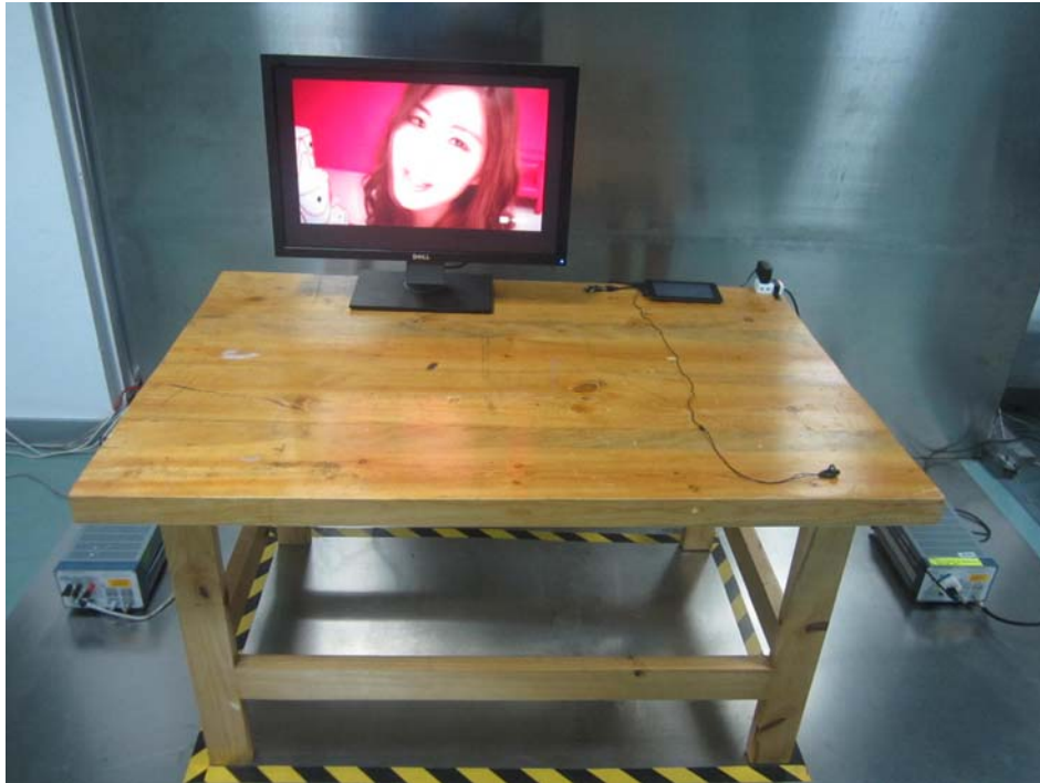
Conducted Emission - Side View