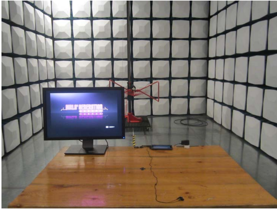
Radiated Emission – Rear View (Below 1 GHz)