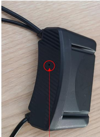
Pinhole Fault Reset Button

If you want to restore the headset to factory default settings, use the Factory Reset in the configuration menu. The headset automatically restores the default settings and turns off.