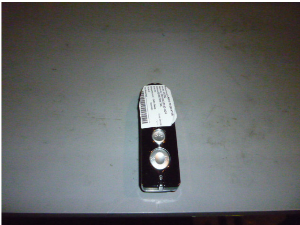
Set-up for Radiation Emission (Transceiver)