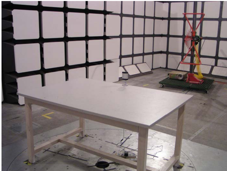
Radiated Emissions - Rear View (30 MHz-1 GHz)