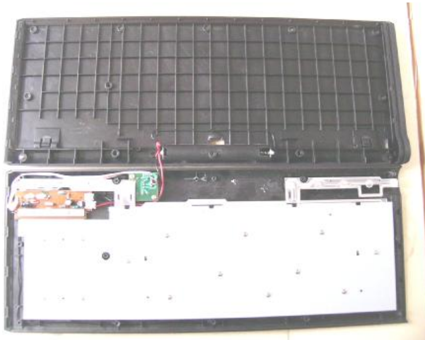
Main board component side