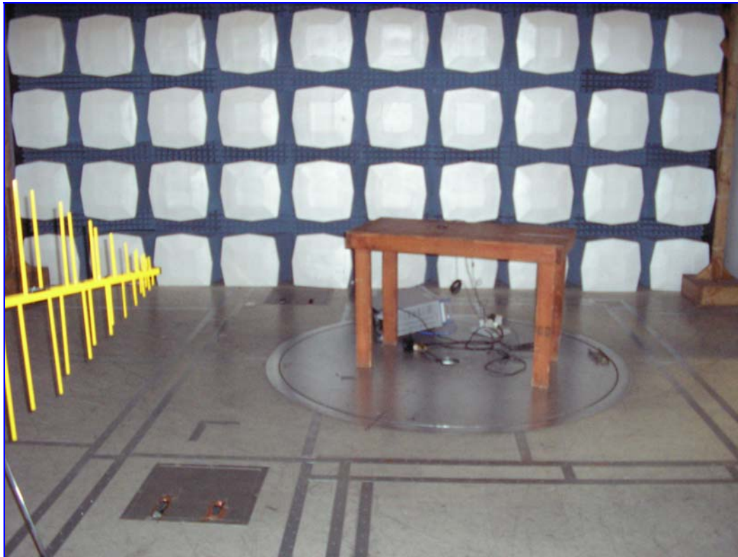
Photograph 1. Radiated Emission Limits Test Setup