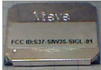
Figure 1. Location of Label on EUT