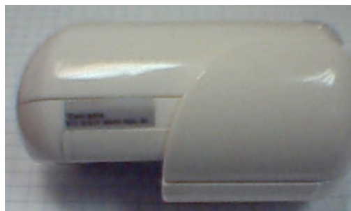
Figure 3. Location of Label on Unit Into Which Module is Installed