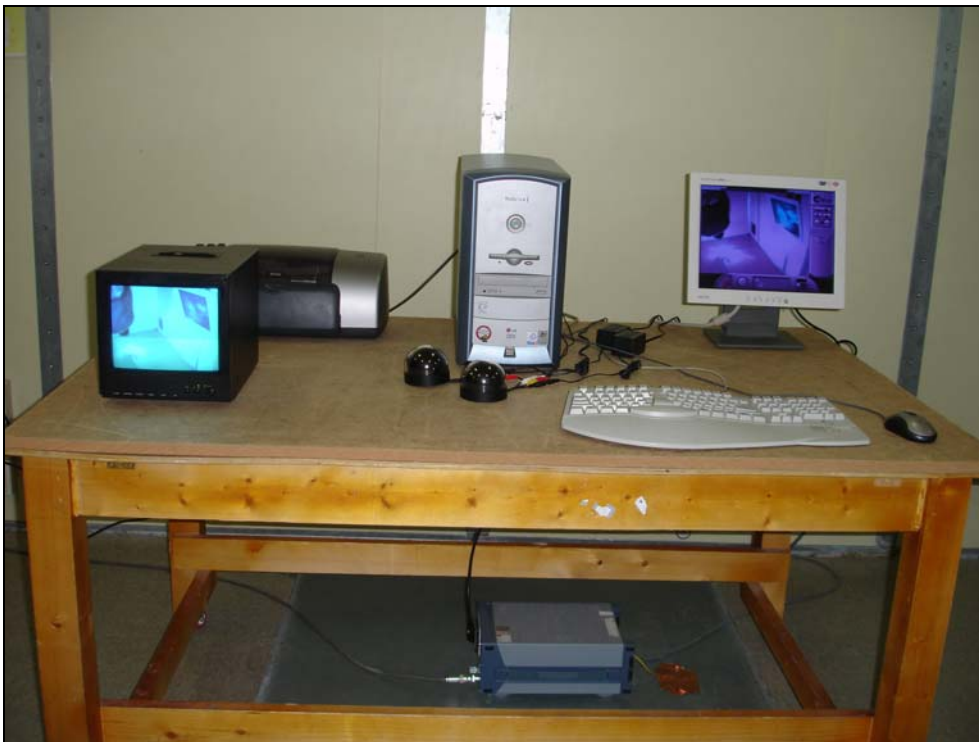
Photograph 1: Setup for Conducted Emissions