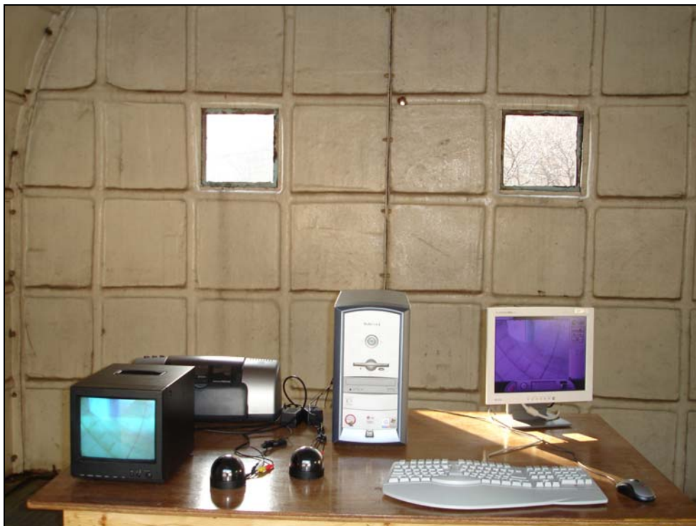
Photograph 2: Setup for Radiated Emissions