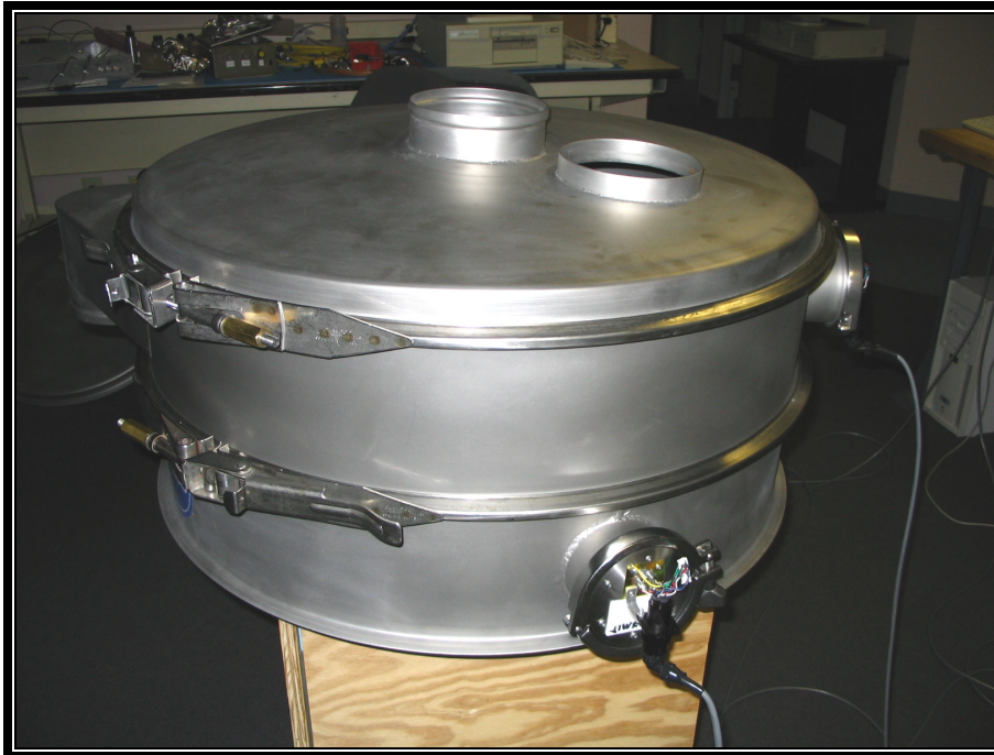
PHOTOGRAPH 9: VIEW OF TRANSMITTER AND RECEIVER WITH CABLES