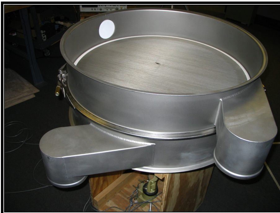
PHOTOGRAPH 10: OTHER SIDE