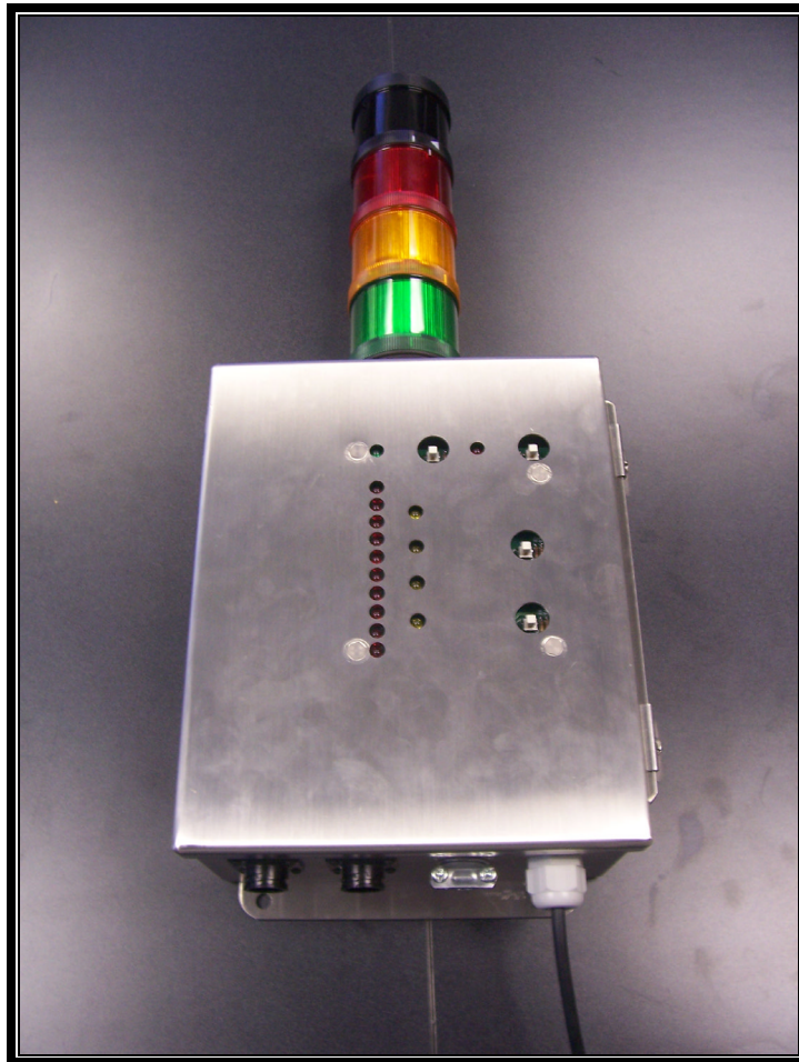
PHOTOGRAPH 11: CONTROL BOX TOP VIEW