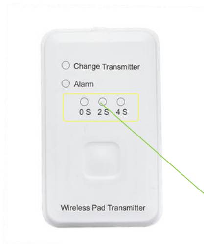
Time delay light (0s, 2s, 4s)