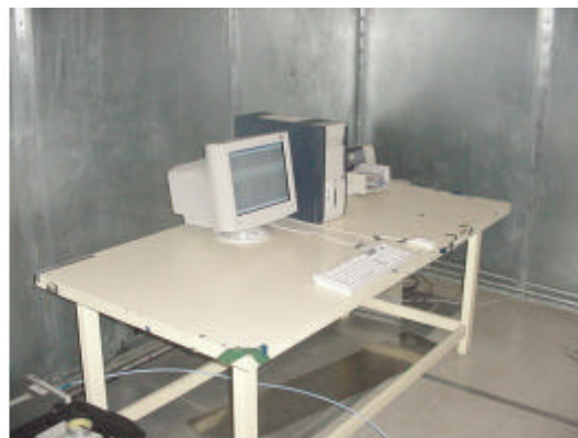
Figure 2 Test set up for conducted disturbance measurement