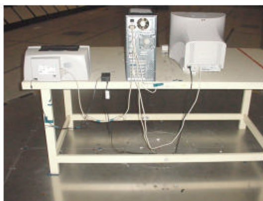
Figure 1 Test set up for radiated disturbance measurement