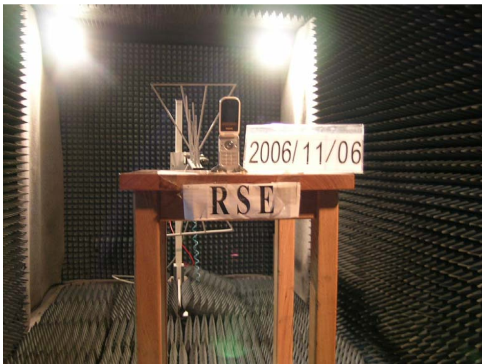
Pic2 Radiated Spurious Emission