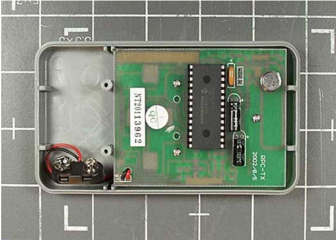
Interior with Cover Removed