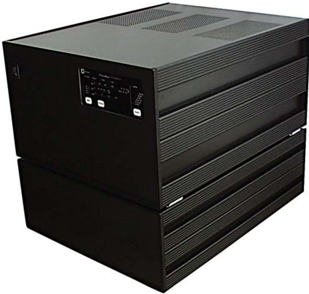
Figure 2. Side View of DX2400L1 RF Deck (TOP) and LPS4800 Linear Power Supply (Bottom)