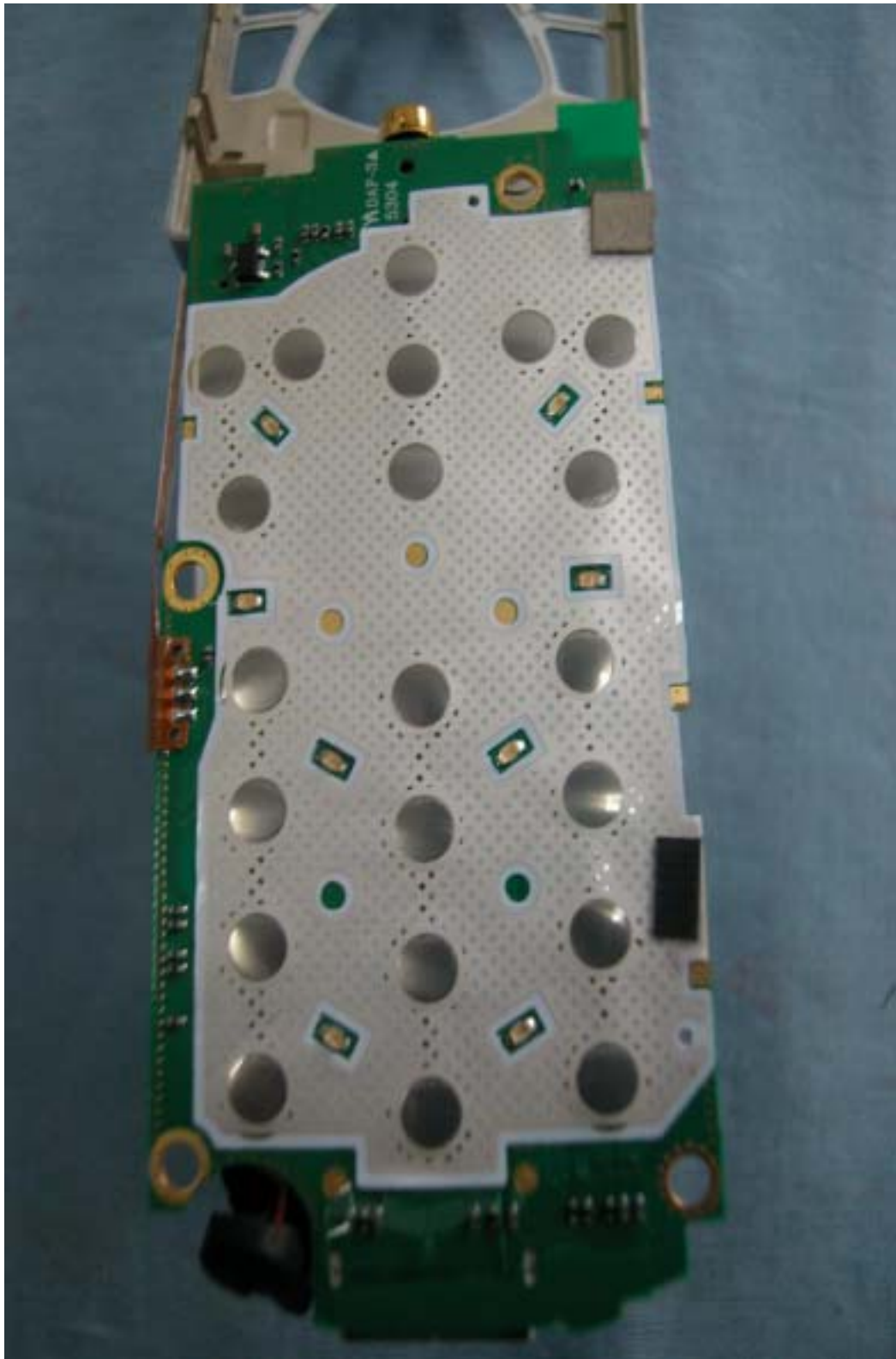
mobile phone PCB front view