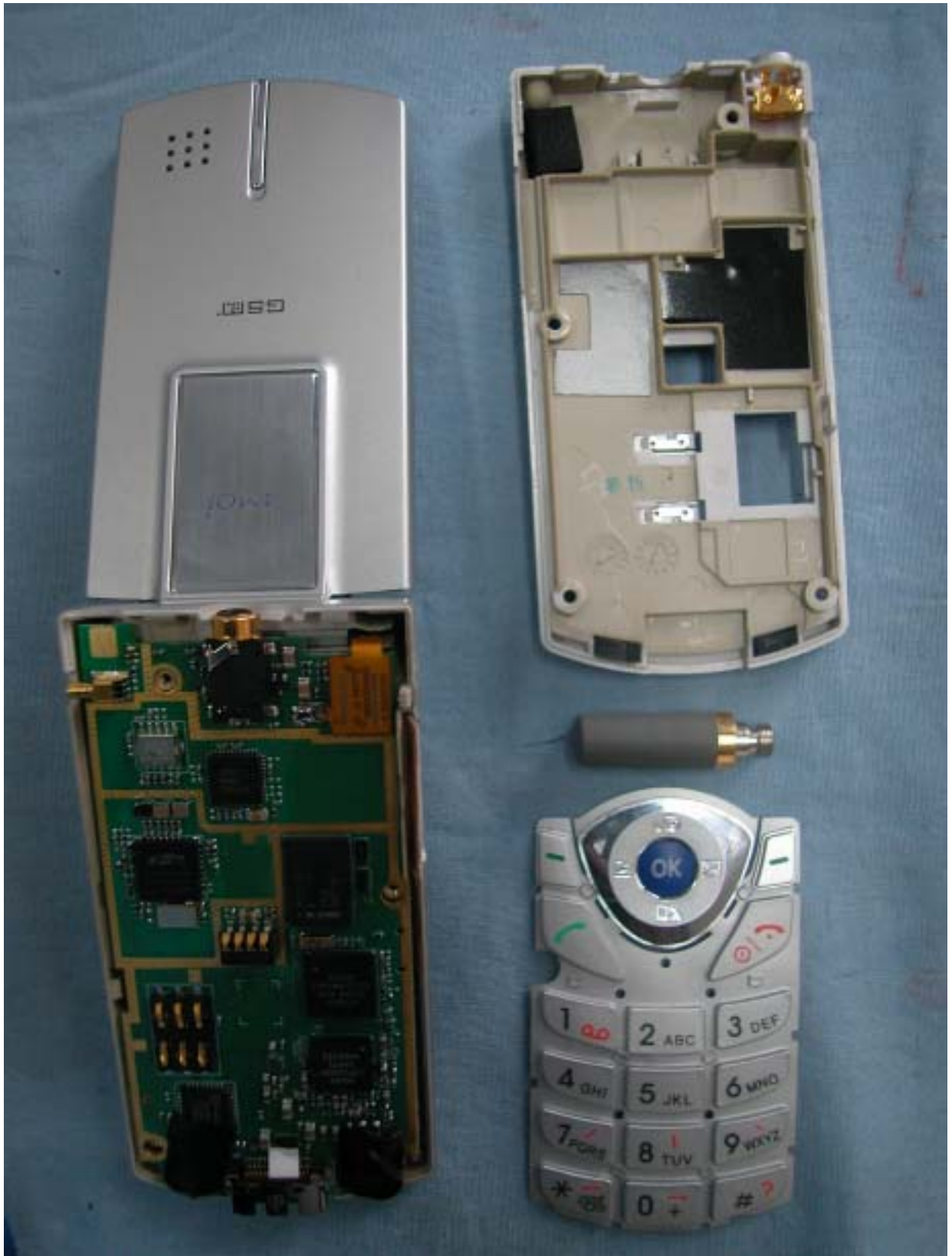
Mobile phone Disassembly