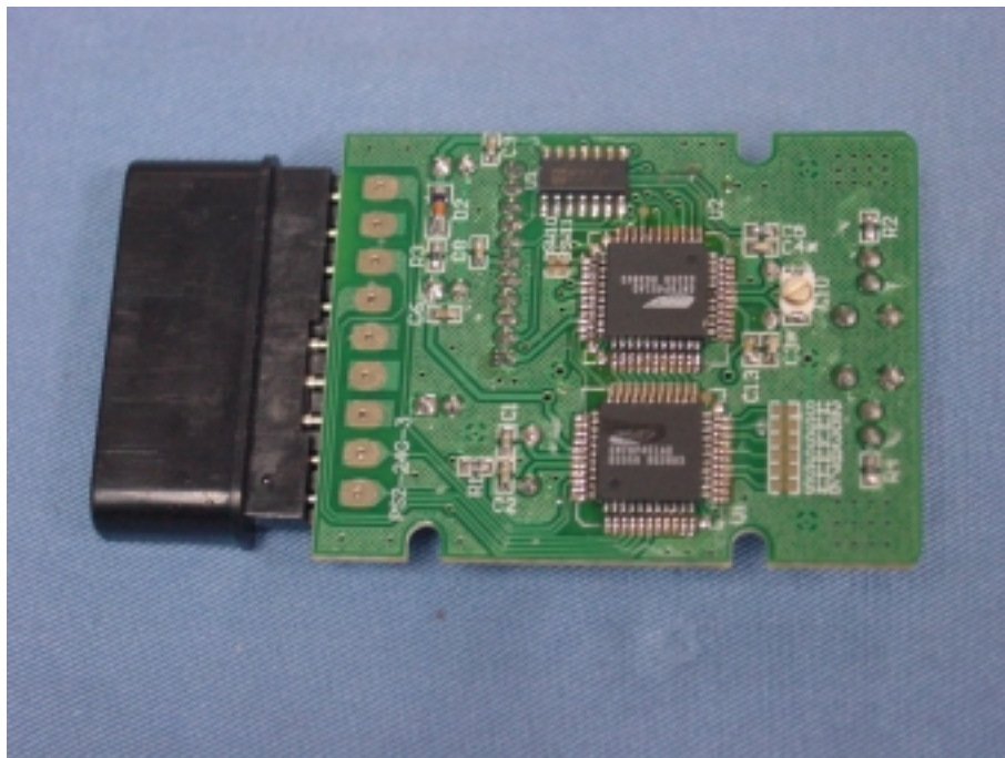
Figure 9 Main Board, Component Side