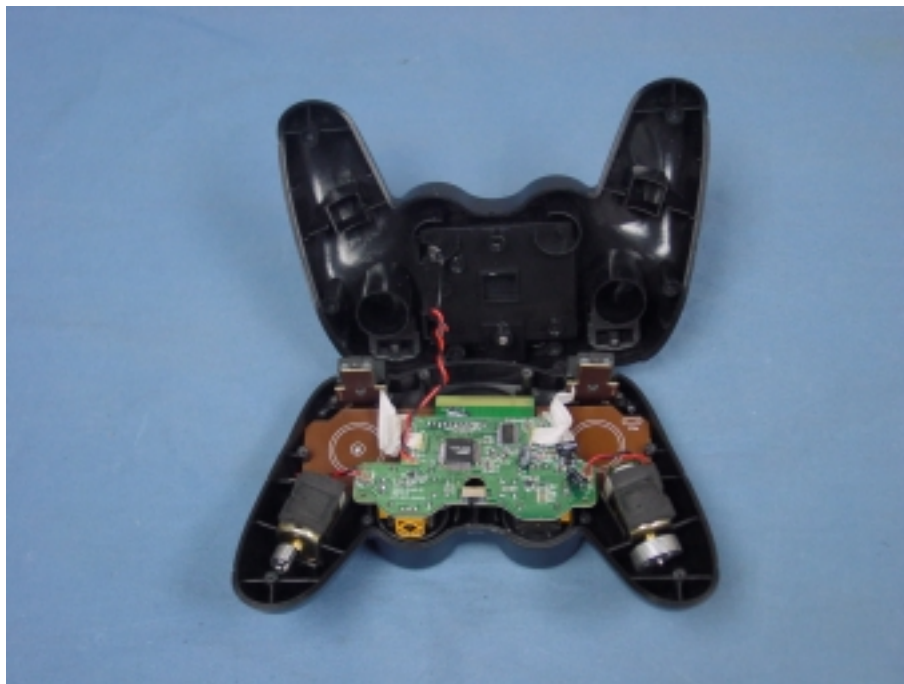
Figure 7 Main Board, Component Side