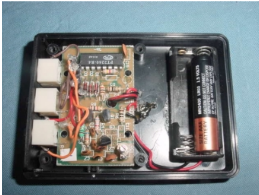
Figure 5 Main Board, Component Side