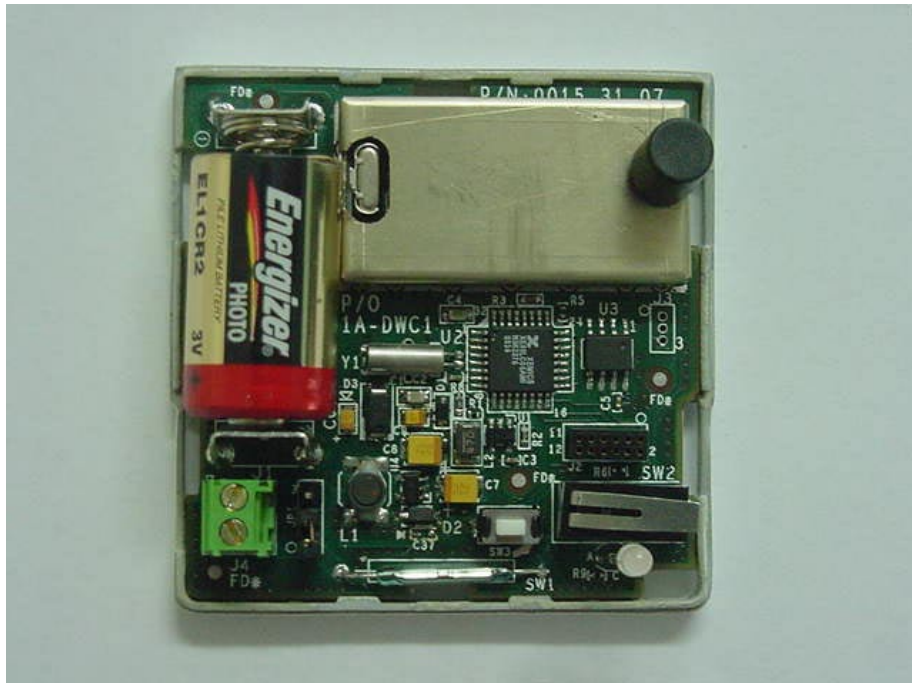
Figure 2 PCB in Unit