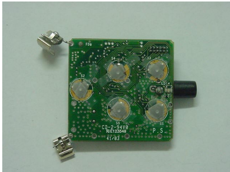
Figure 4 PCB Side 2