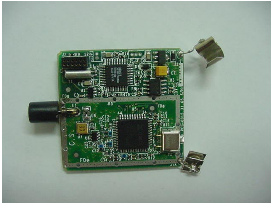
Figure 3 PCB Side 1