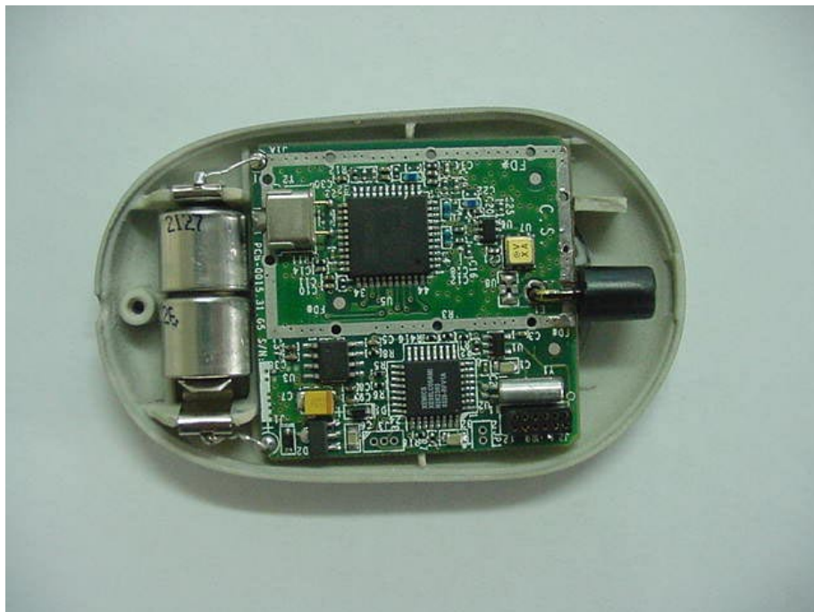
Figure 2 PCB in Unit