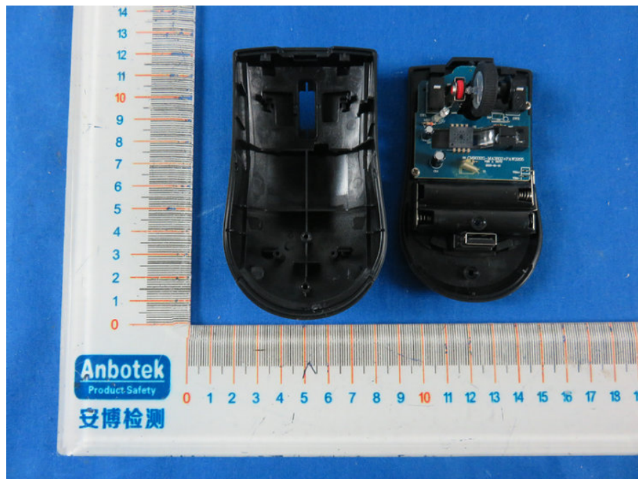
The EUT-Inside View