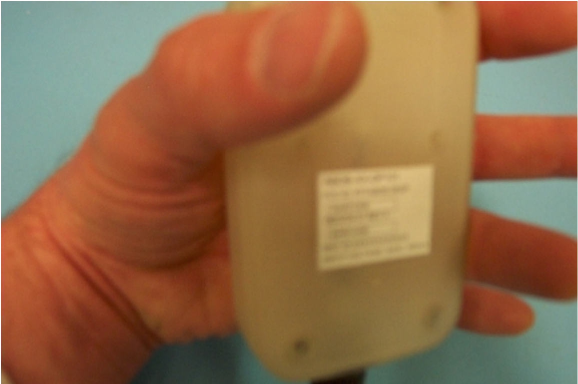
Size of the EUT and Label Location – View #1