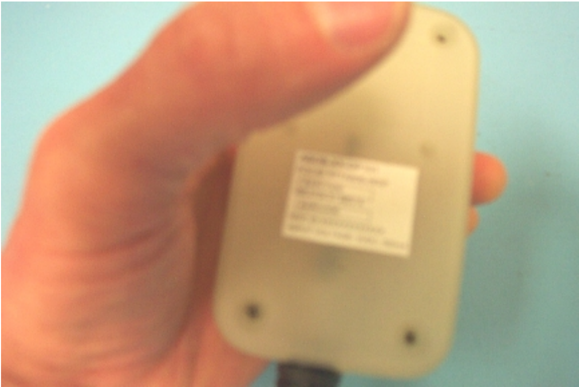
Size of the EUT and Label Location – View #2