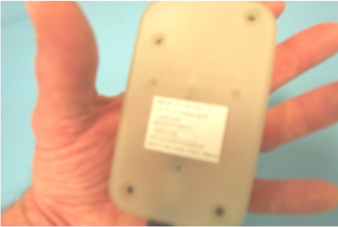
Size of the EUT and Label Location – View #3