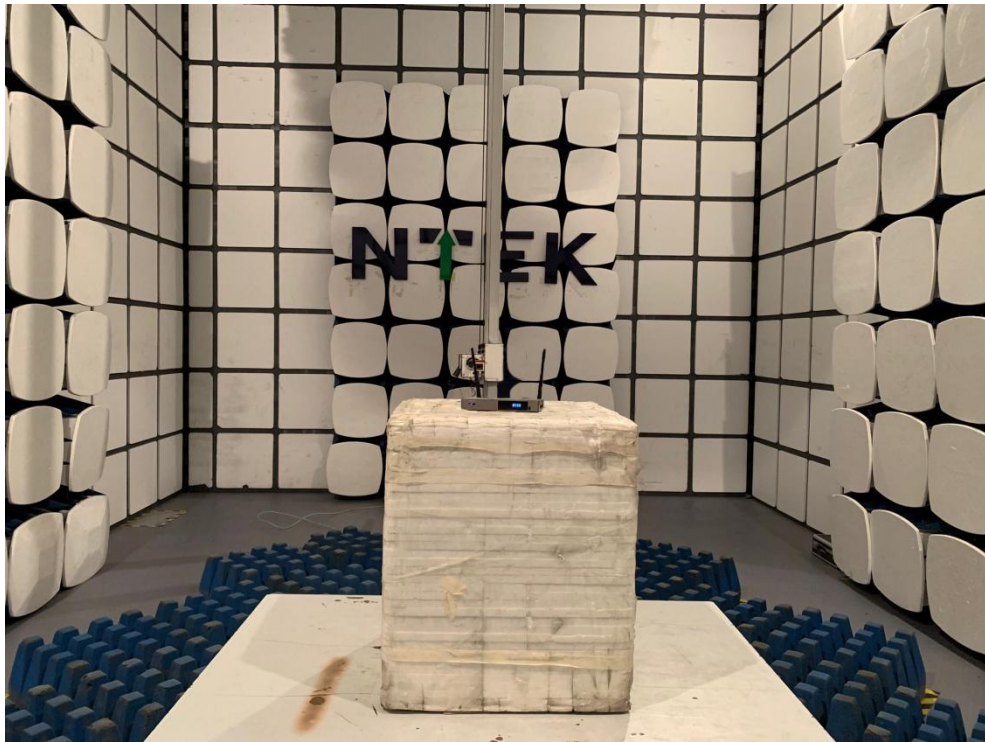
Conducted Measurement Photos