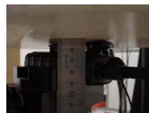
Figure 12. Body SAR