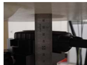
Figure 11. Mouth Face