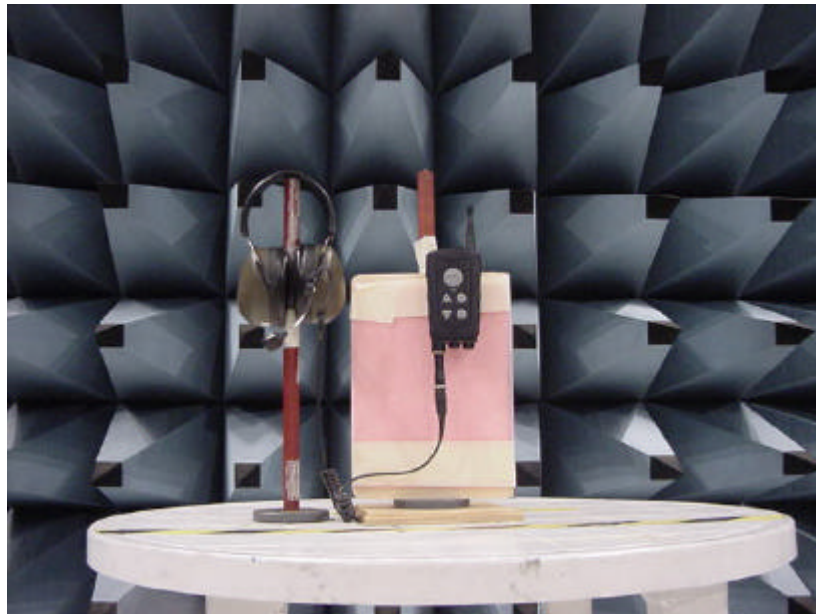
Radiated spurious emission 30 - 1000 MHz