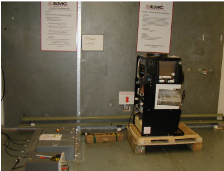
Conducted Emissions (Ground Plane 3)