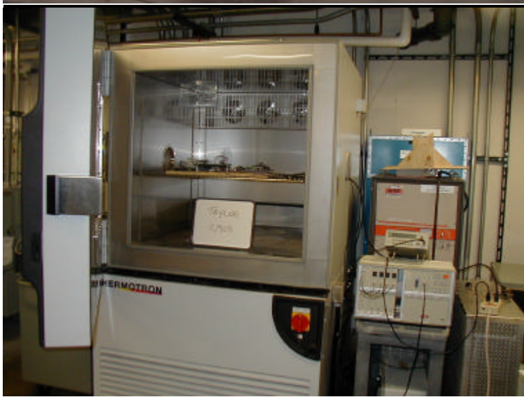
Temperature Stability (Thermotron Chamber) & Voltage Stability