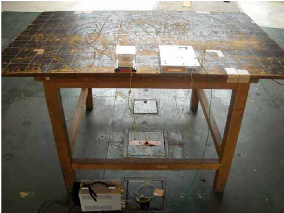
- Rear View -

* The EUT was rotated all axis(X-axis, Y- axis, Z-axis),this photograph present configuration with maximum emission.