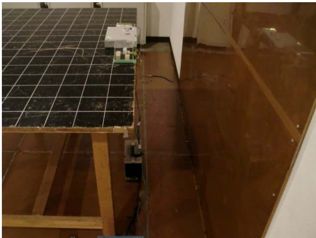
- Side View -

* The EUT was rotated all axis(X-axis, Y- axis, Z-axis), this photograph present configuration with maximum emission.