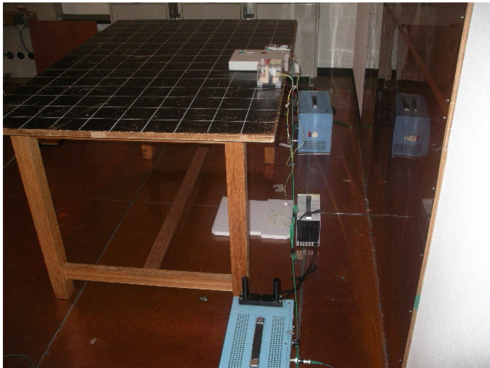
- Side View -

* The EUT was rotated all axis(X-axis, Y- axis, Z-axis), this photograph present configuration with maximum emission.