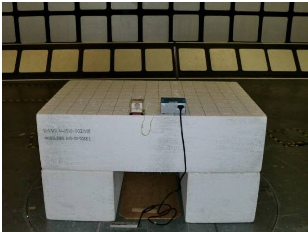
- Rear View -