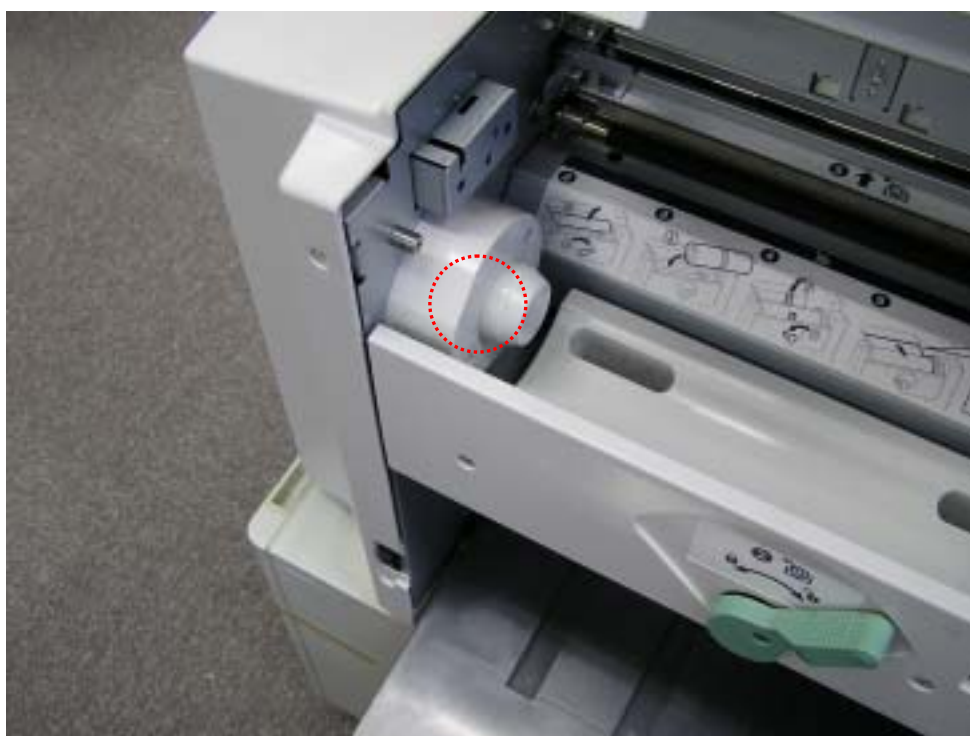
Photo2: Location of RF Module-2