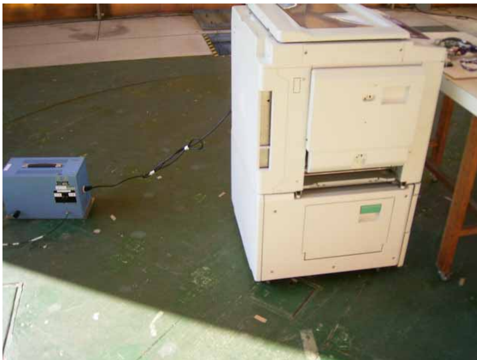
- Rear View -

Photograph present configuration with maximum emission