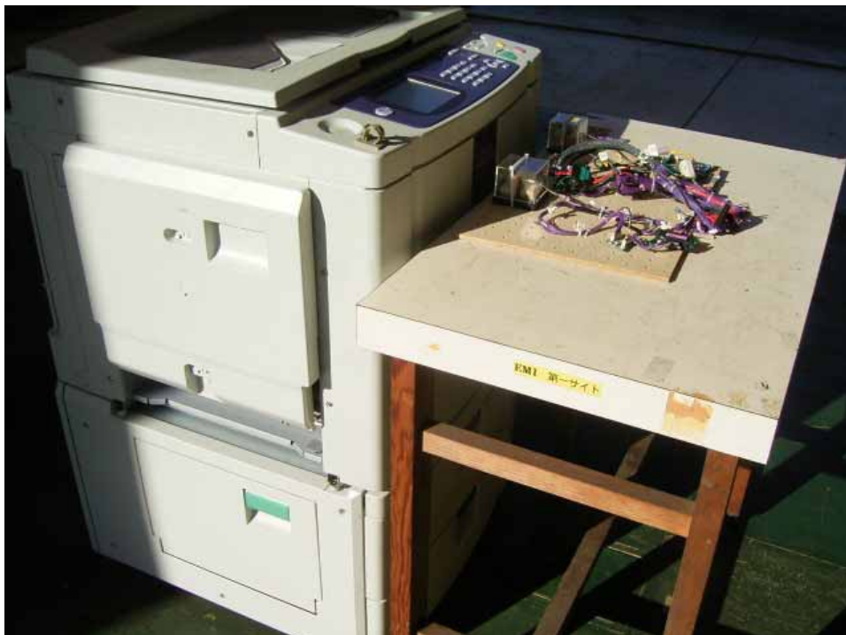
- Rear View -

Photograph present configuration with maximum emission