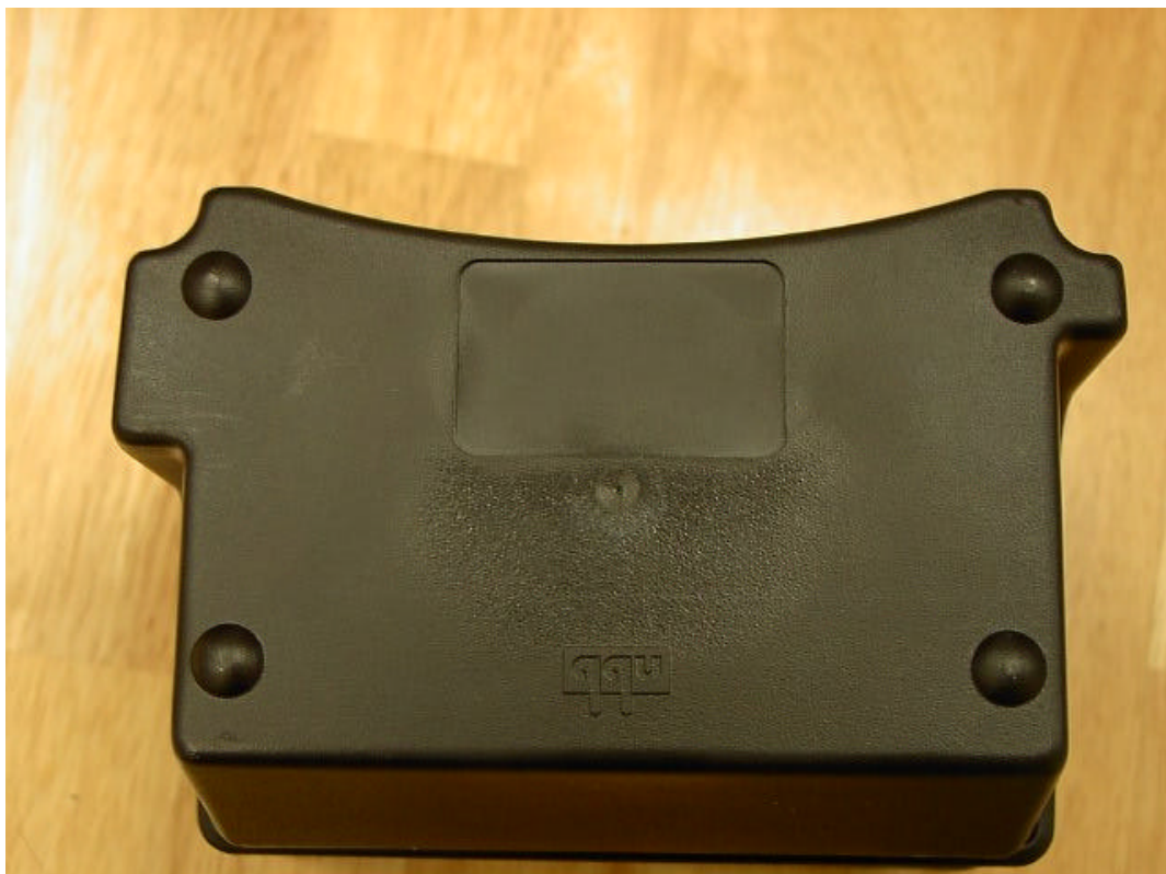
Marking plate located at bottom of handheld unit

The size of the label is approximately 56x33.5mm