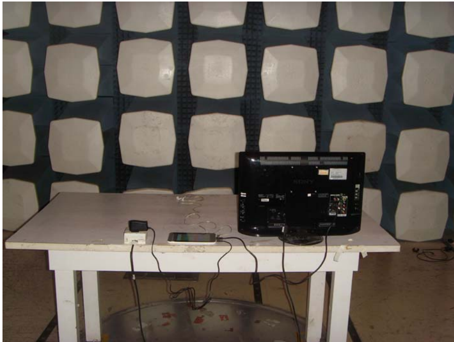
Radiated Emission Test Set-up(Rear View)