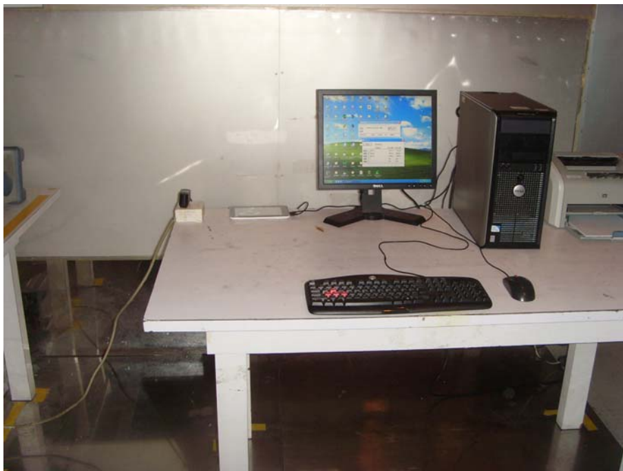
Conducted Emission Test Set-up(Connected to PC mode)