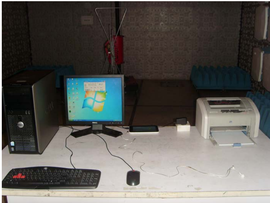
Radiated Emission Test Set-up (Front View)