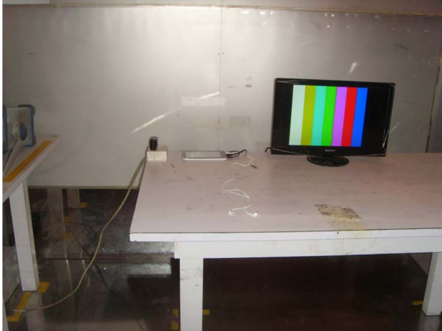
Conducted Emission Test Set-up(TF Card Playing Mode)