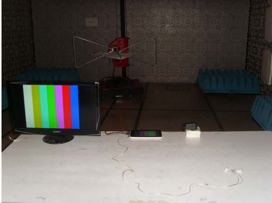
Radiated Emission Test Set-up(Front View)