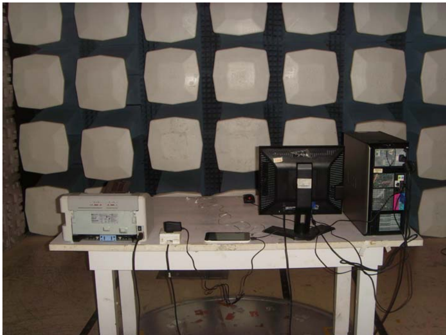
Radiated Emission Test Set-up (Rear view)