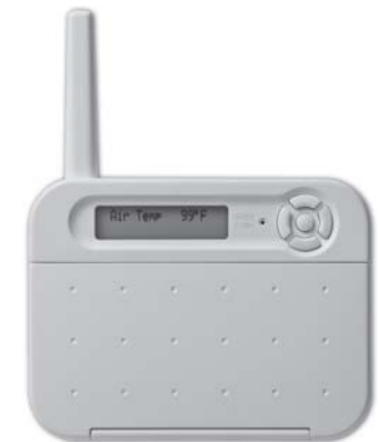
wall mount model