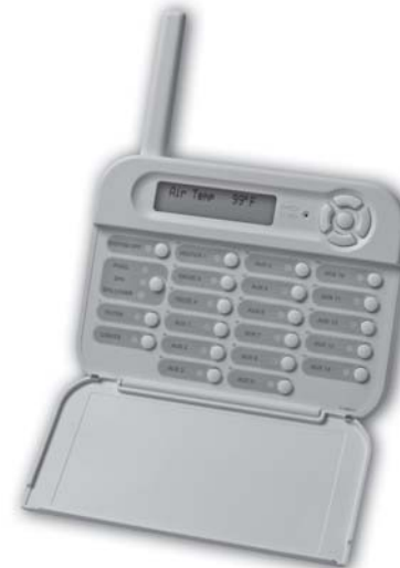
table top model