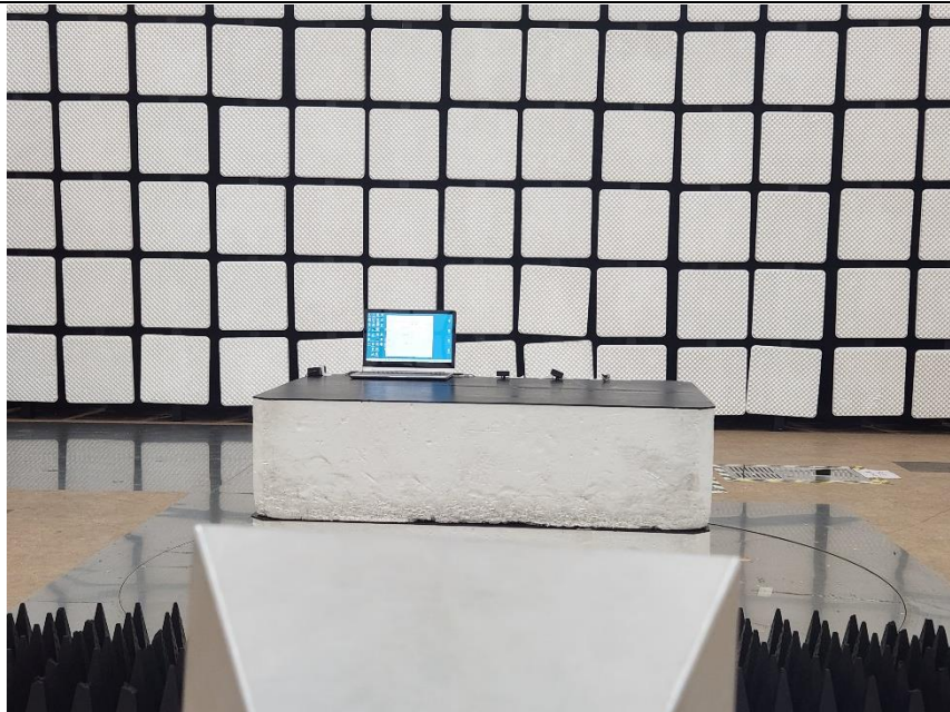
[Rear view of Radiated Emission (1 000 MHz ~ 30 000 MHz)]