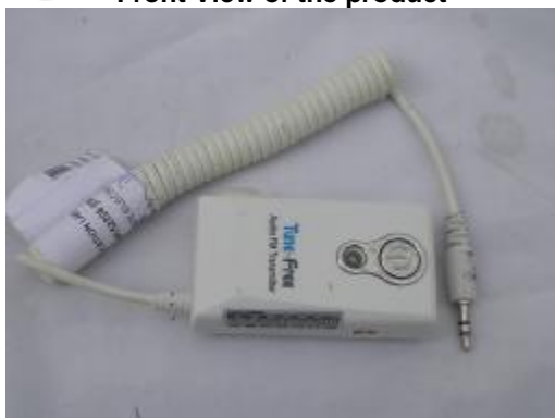
Front View of the product