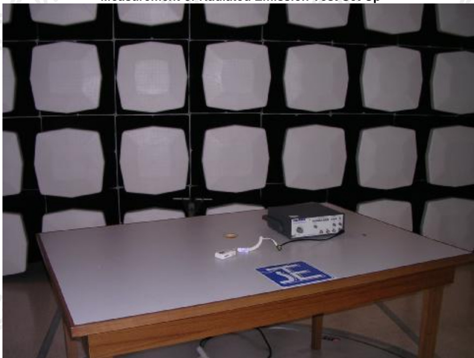
Measurement of Radiated Emission Test Set Up