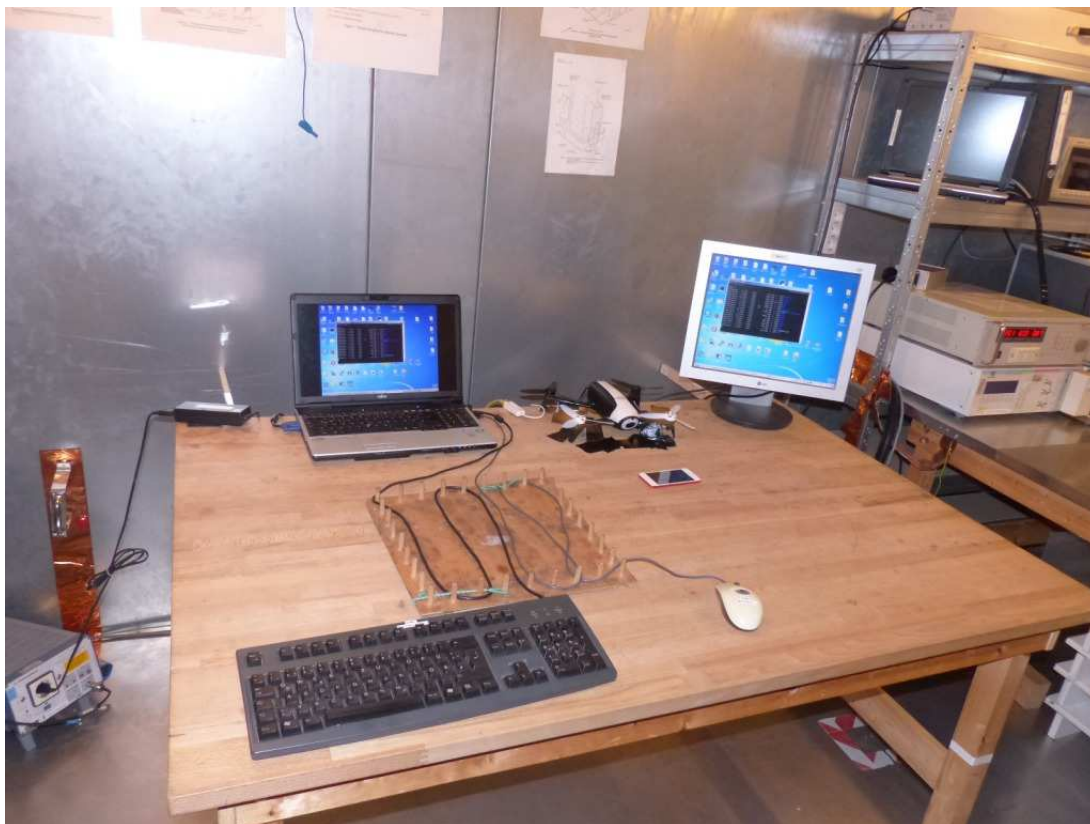
Photo 4: Test setup for conducted measurements (computer peripheral setup, EUT supplied by USB-cable from computer, charging mode, unintentional radiator §15)