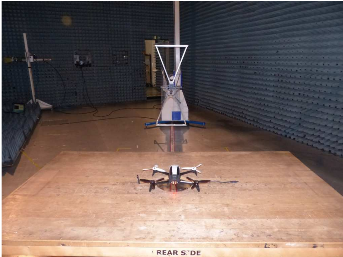
Photo 2: Test setup for radiated measurements (Enclosure, semi-anechoic chamber, 30 MHz to 1 GHz, intentional radiator §15)