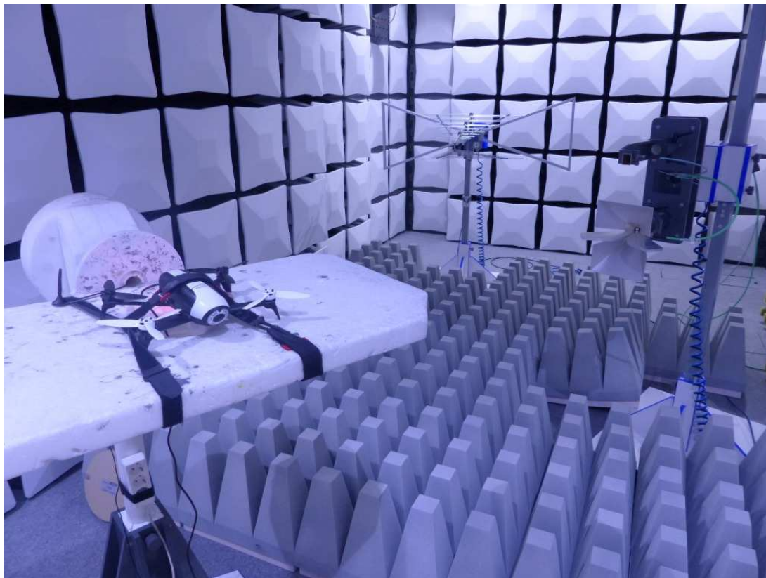
Photo 3: Test setup for radiated measurements (Enclosure, fully-anechoic chamber, 1-18 (15) GHz intentional radiator §15)