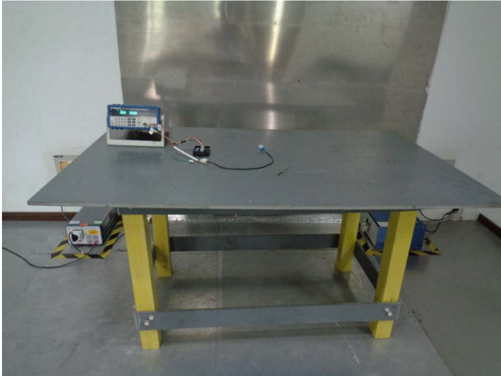
Conducted Emissions Test Setup Front View