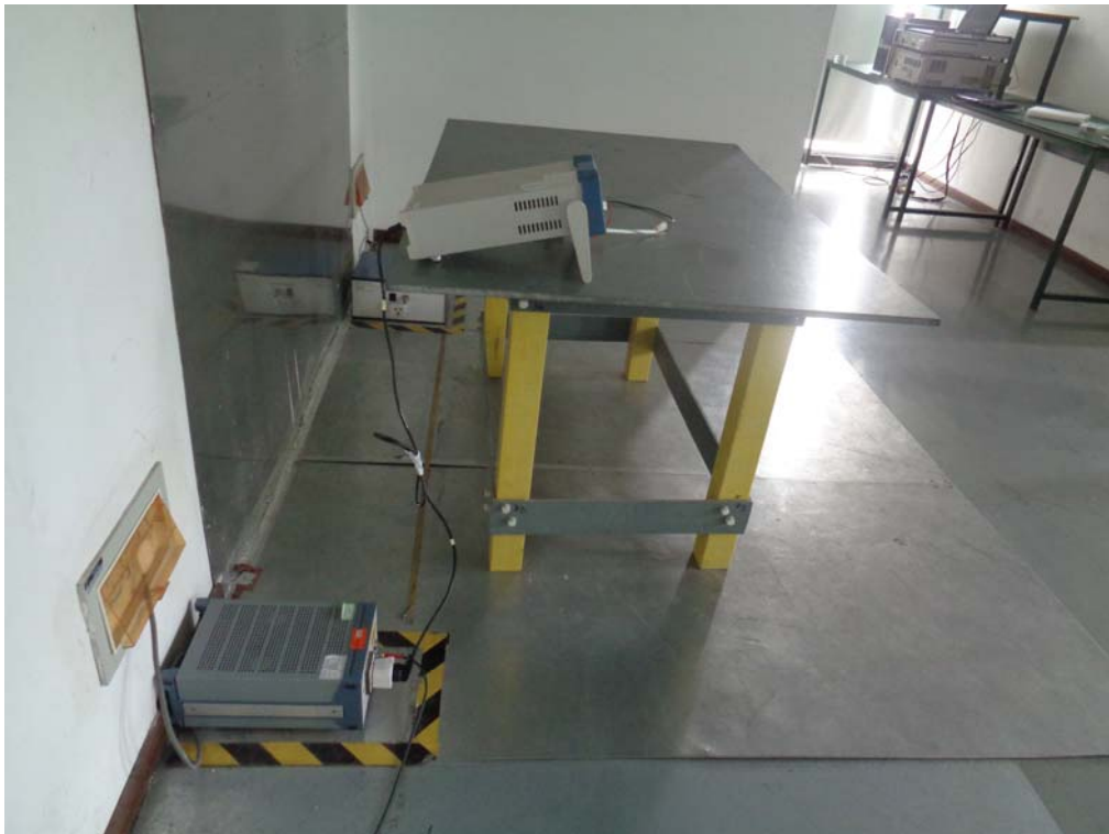
Conducted Emissions Test Setup Side View